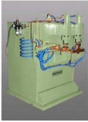
TBH - 250 Resistance Heating Machines