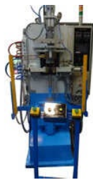
TMG V - 50 Metal Gathering Machine