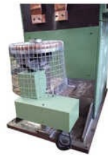
Auto Bench Type Spot Welding Machine