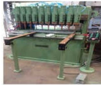
Multi Stationed Spot Welding Machine