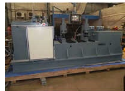
Torsion Bars Heating Machines