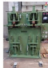
Electrical Upsetting Machine