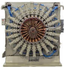
Enviro Multi Spot Welding Machine