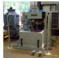
Projection Welding With Nut Feeder