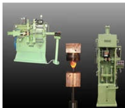
TMG V-25 Metal Gathering Heating