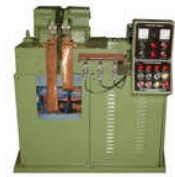
Chain Links Flash Butt Chain Links Welding