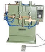
TBH - 25 Resistance Heating Machines