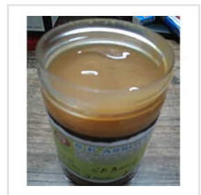
Adhesive Gum For Box File, Notebooks And