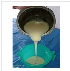
Adhesive For PET Bottle Labeling