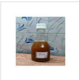
Adhesive Gum For Side Pasting Of Corrugated