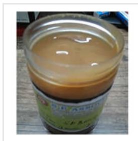
Adhesive Gum For Paper Bag And