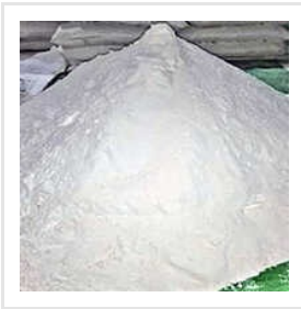
Corrugated Box Side Pasting Gum Powder A