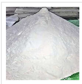
Gum Powder For Multiwalled And Mono