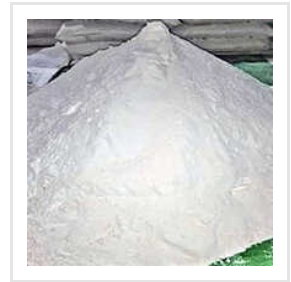
Briquette Binder Gum Powder