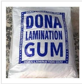
Paper Plate (Dona) Gum Powder For