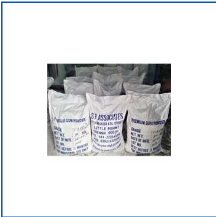
CORRUGATION AND SHEET PASTING GUM POWDER A SLOW SPEED SEMI-AUTOMATIC MACHINE

Adhesive Gum for Box File, Notebooks and Books, Adhesive Gum for Paper Bag and Envelope, Adhesive Gum for Side Pasting of Corrugated Box, Adhesive for PET Bottle Labeling, Briquette Binder Gum Powder, Corrugated Box Side Pasting Gum Powder a Machine and Manual Application, Corrugation and Sheet Pasting Gum Powder a High Speed Fully Automatic Machine, Corrugation and Sheet Pasting Gum Powder a Slow Speed Semi-Automatic Machine, Flute to Paperboard Gum Powder a Flute Laminator Machine, etc.