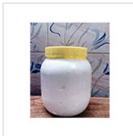
Synthetic Adhesive For Varnished Carton Side