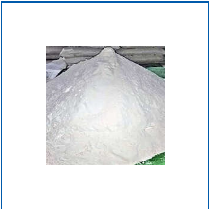
CORRUGATION AND SHEET PASTING GUM POWDER A HIGH SPEED FULLY AUTOMATIC MACHINE