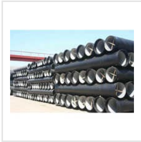
Ductile Iron Spun Pipes