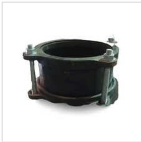
Cast Iron Pipe Collar Joint