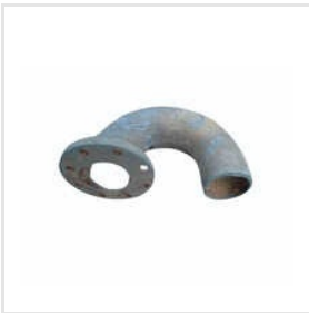
Cast Iron U Bend