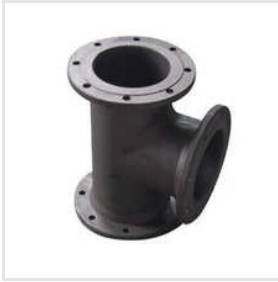
Di Flanged Fitting