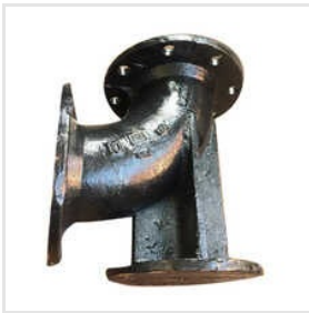
Ductile Iron Duckfoot Bend