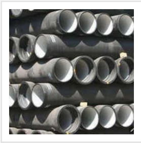
Ductile Iron Pipes