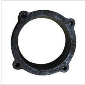
C I D Joints Fittings