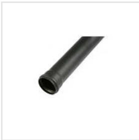
Round Di Pipe