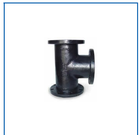
DUCTILE IRON TEE