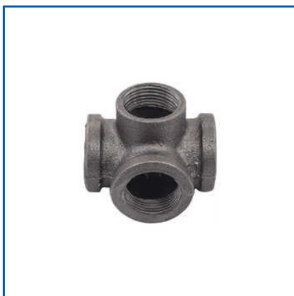
DUCTILE IRON CROSS SOCKET

3 Inch Cast Iron Bend, All Flanged Tee, C I D Joints Fittings, Cast Iron Air Release Valve, Cast Iron Fire Hydrant Valve, Cast Iron Long Collar Pipe Joint, Cast Iron Non Return Valve, Cast Iron Pipe Collar Joint, Cast Iron Pipe Reducer, Cast Iron Sluice Valve, Cast Iron U Bend, DI Pipe Socket, DI Double Flanged Pipe, DI Flanged Fitting, Ductile Cast Iron Double Flanged Reducer, etc.