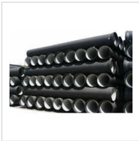
Ductile Iron Double Flanged Pipe