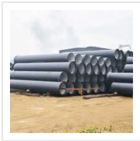
K9 Ductile Iron Pipes