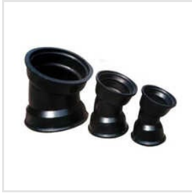
Ductile Iron Pipes Fittings