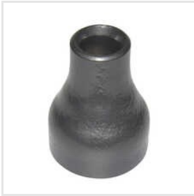
Cast Iron Pipe Reducer