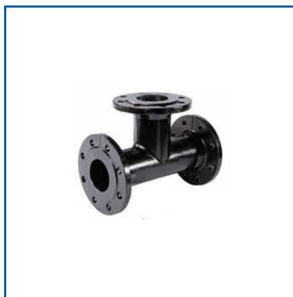
DUCTILE IRON FLANGED TEE