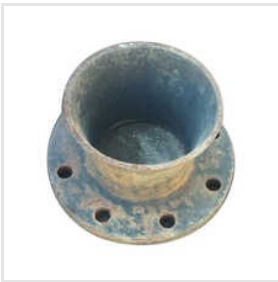
Ductile Iron Bell Mouth