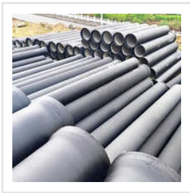
Di Double Flanged Pipe