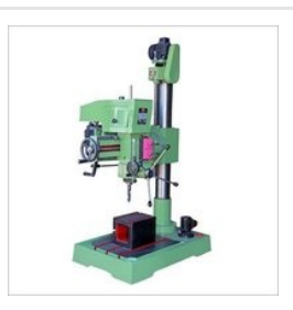
32 MM Finefeed (MT4) Heavy Duty