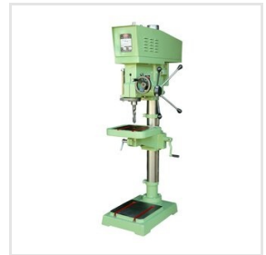
32mm FineFeed (MT4) Heavy Duty Pillar Drill