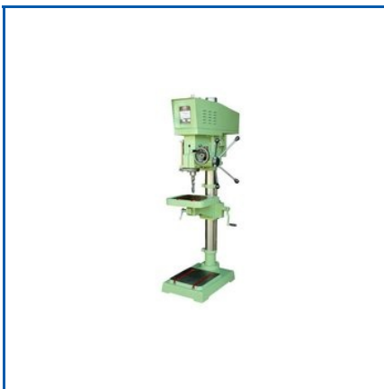
25MM FINEFEED HEAVY DUTY PILLAR TYPE DRILL MACHINE

12MM TAPPING MACHINE, 13 MM Pillar Type Drill Machine, 19MM Tapping Machine, 20 mm heavy duty pillar type drill machine, 20 mm pillar type drill cum tapping machines, 25 mm pillar type drill cum tapping machine, 25MM Finefeed Heavy Duty Radial Type Drill Machine, 25mm Finefeed Heavy Duty Pillar Type Drill Machine, 32 MM Finefeed (MT4) Heavy Duty Radial Type Drill Machine, 32mm FineFeed (MT4) Heavy Duty Pillar Drill Machine, etc.