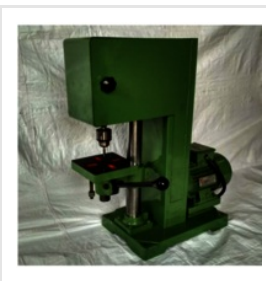
6MM TAPPING MACHINE