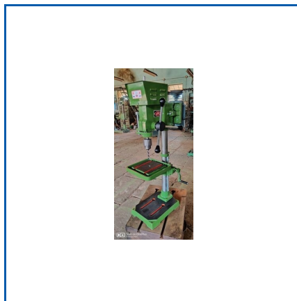
13 MM PILLAR TYPE DRILL MACHINE