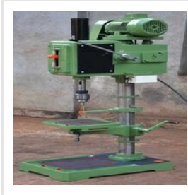
19MM Tapping Machine