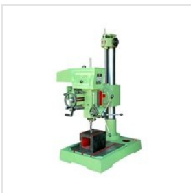
25MM Finefeed Heavy Duty Radial Type Drill