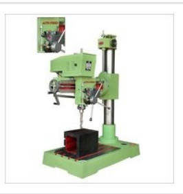
40mm Heavy Duty Autofeed Radial Type