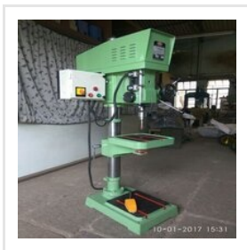
25 Mm Pillar Type Drill Cum Tapping Machine