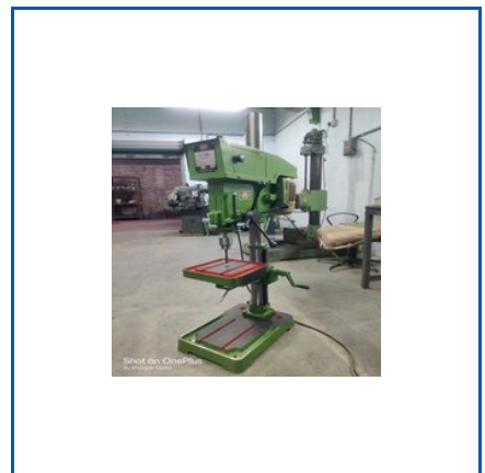
20 MM HEAVY DUTY PILLAR TYPE DRILL MACHINE