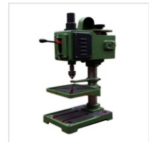
12MM TAPPING MACHINE