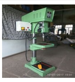
40 Mm Pillar Type Drill Cum Tapping Machine