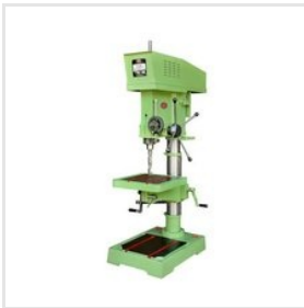
40 Mm Finefeed (MT4) Heavy Duty Pillar Drill