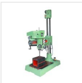
40 Mm Finefeed Heavy Duty Radial Type Drill