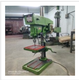
20 Mm Heavy Duty Pillar Type Drill