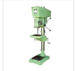
25mm Finefeed Heavy Duty Pillar Type Drill