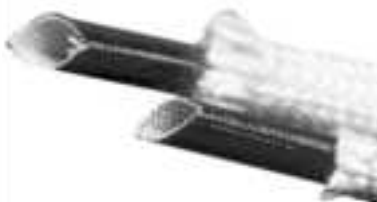
Glass Braided Acrylic Coated Fiberglass Sleeve