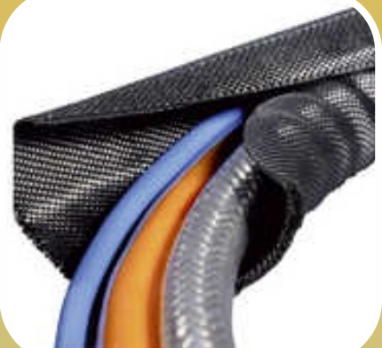
Braided Self Wrapping Sleeve Twist Tube