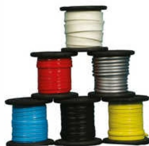
Flexible Silicon Rubber Coated Fiberglass Sleeve