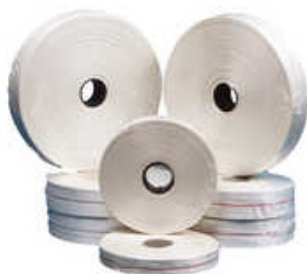
Adhesive Fibreglass Tape