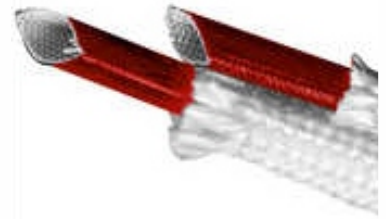
Glass Braided Silicon Coated Fiberglass Sleeve