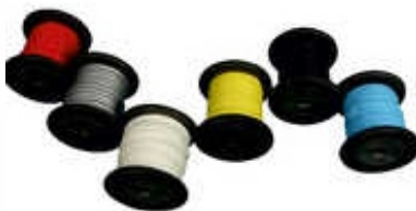
Silicone Rubber Coated Fiberglass Sleeving