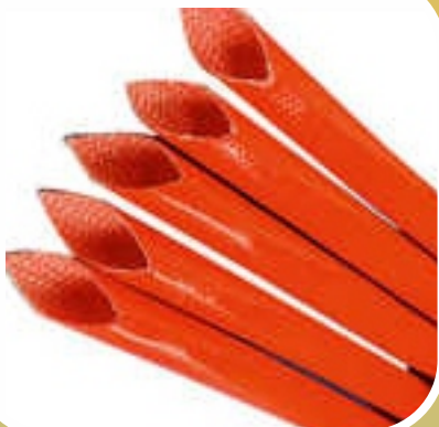
Silicone Rubber Coated Fiberglass Sleeving