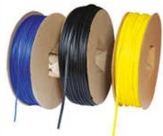
Acrylic Coated Fiberglass Sleeve