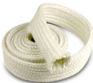
KIRAPFH - 155 Polyester Flat Hose