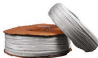
KIRAFFH - 550 Fibreglass Flat Hose