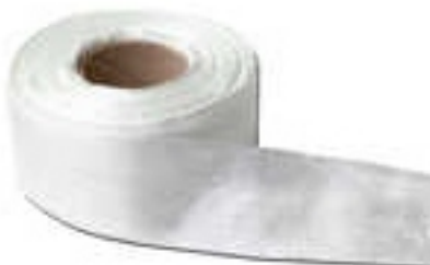
Non Adhesive High Tensile Fibreglass Tape