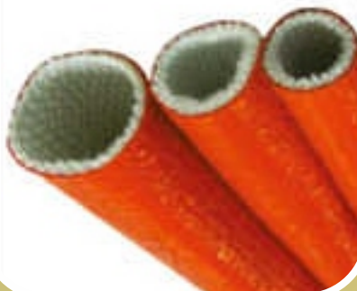
Silicon Coated Fiberglass Fire Sleeve