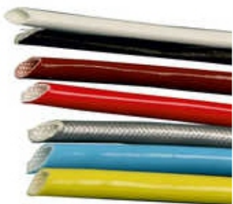
Silicone Rubber Coated Fiberglass Sleeving