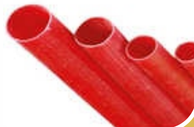
Polyurethane Coated Fiberglass Sleeving