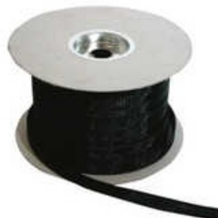
Nylon Monofilament Sleeving