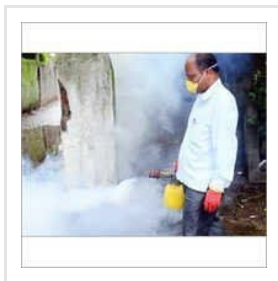
Fogging Treatment For Mosquitoes