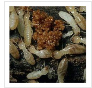
Termite Removal Service