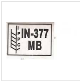
ISPM 15 Standard Fumigation