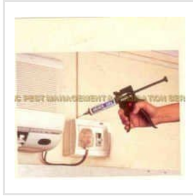
Cockroach Gel Application