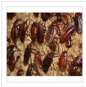
Cockroach Removal Service