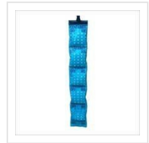
Desiccants Moisture Control Treatment