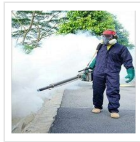
Mosquito Control Services