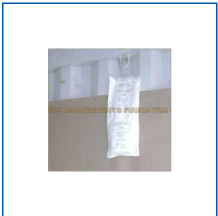
FUNGAL CONTROL MEASURES