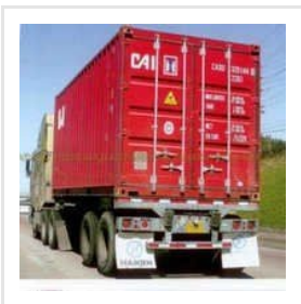
Cargo Container Fumigation