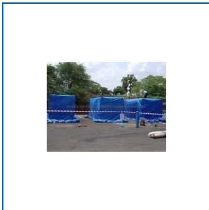
SHIPPING CONTAINER FUMIGATION