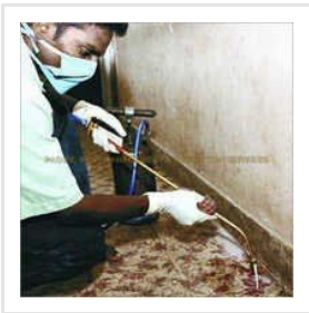
Post Construction Anti Termite Treatment