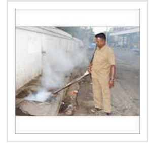
Fogging For Mosquito