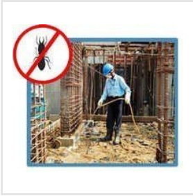
Pre Construction Anti Termite Treatment