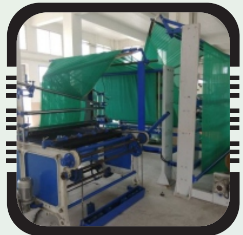
Agronet Four Folding Machine