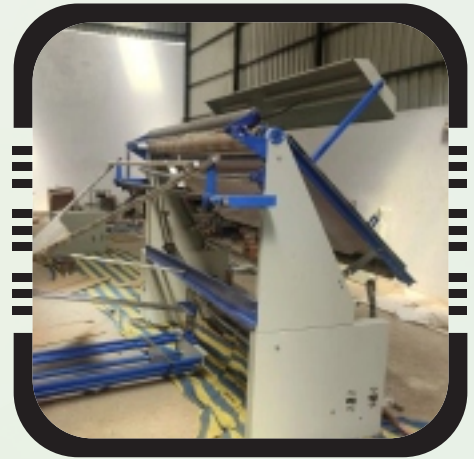
Knitted Fabric Inspection Machines