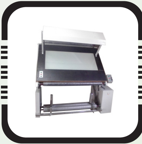
Tubular Fabric Inspection Rolling Machine