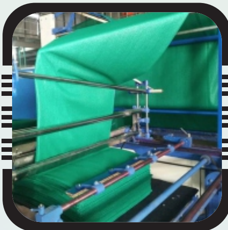
Agro Shade Net Four Fold Plating With Pneumatic Cloth Guider