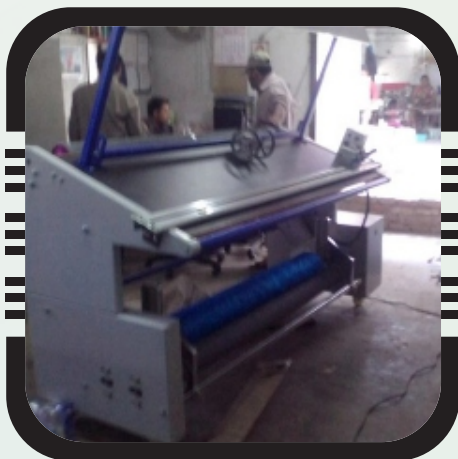
Fabric Mending Machine