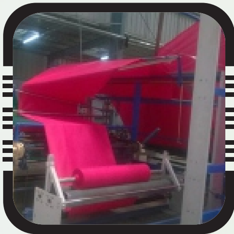
Double Folding Cum Rolling Machine