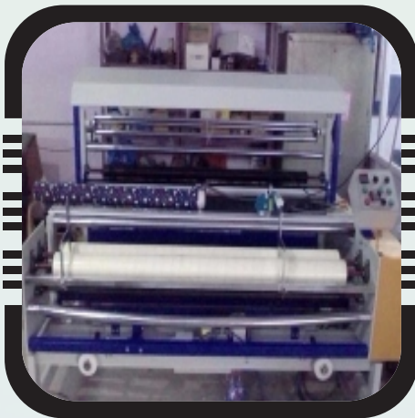
Mini Rolling Machine With Inspection