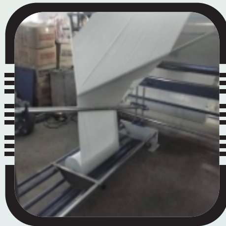
Fabric Fold Opening Machine