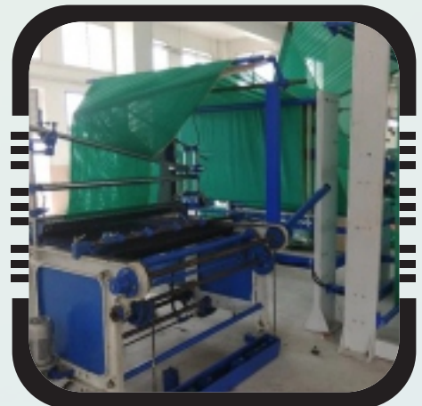
Four Folding And Plating Machine