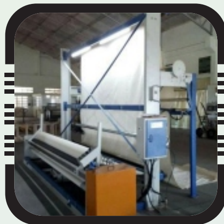
Fabric Rolling Batching Machine