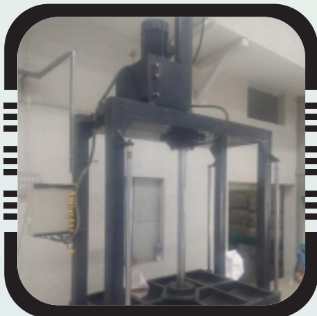
Green Net Four Folding Cum Plating Machine