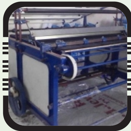
Fabric Single Folding Machine