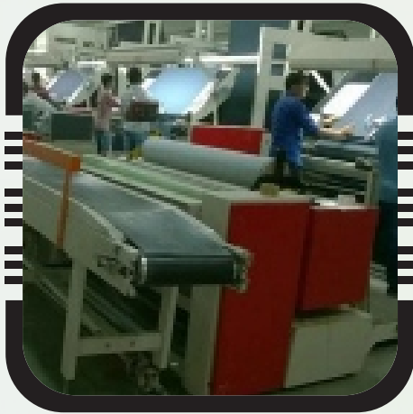
Fabric Inspection Cum Rolling Machine