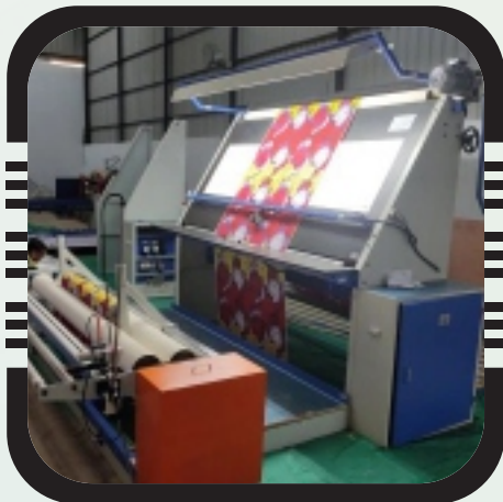
Woven Fabric Inspection Rolling With Surface Unwinder Machine