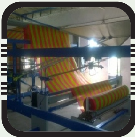
Fabric Double Folding Machine