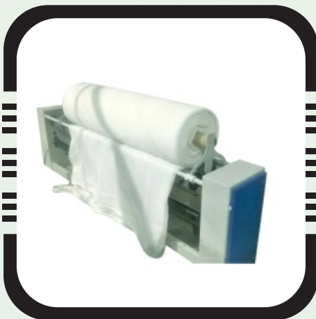
Industries Fabric Simple Rolling Machine