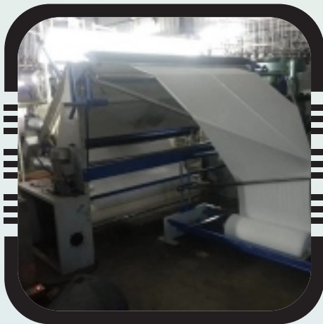
72 Inch Tubular Fabric Fold Opening Inspection Rolling Machine