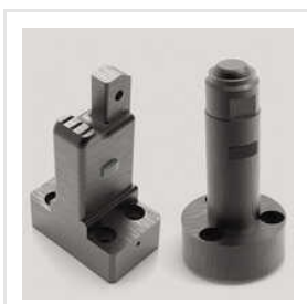
2 Point Equaliser