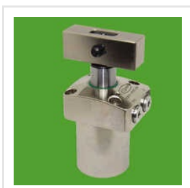
Swing Cylinder P-Type Top Flange Mounting