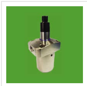
Swing Cylinder Top Flange Mounting