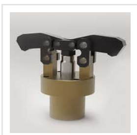
Double Link Clamp