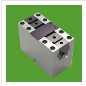
Pneumatic Centering Vice