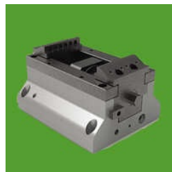
MECHANICAL CENTERING VICE