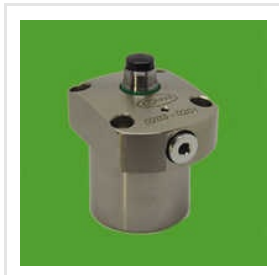
Single Acting Flange Mount