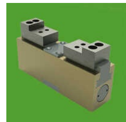
DOUBLE ACTING CENTERING VICE