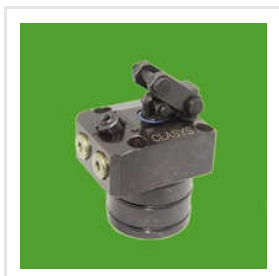
Double Acting Link Clamp With Clamp