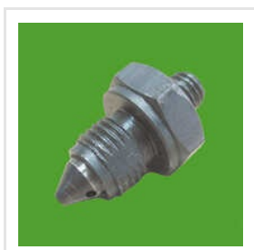
Flow Control Valve