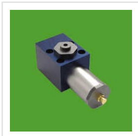
Pressure Reducing Valve