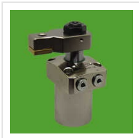
Swing Cylinder Top Flange Mounting