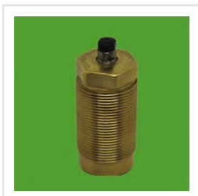
Pneumatic Manifold Mount