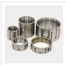
Hydraulic Expansion Collets