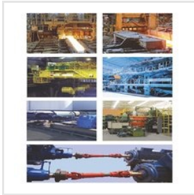
Drive Line Product Range For Industrial