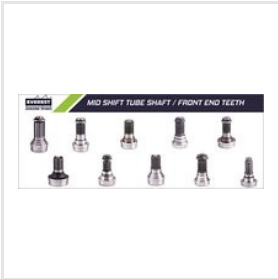
Mid Shift Tube Shaft