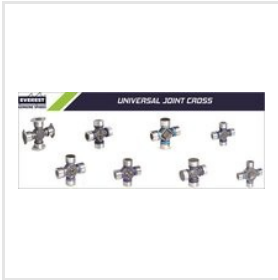
Universal Joint Cross