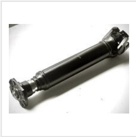
Cardan Shafts For Rolling Mills