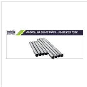
Propeller Shaft Tube