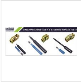
Steering Cross Assembly