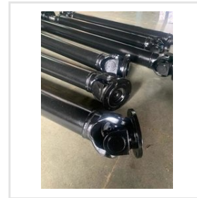
Propeller Shafts For Fire Brigade