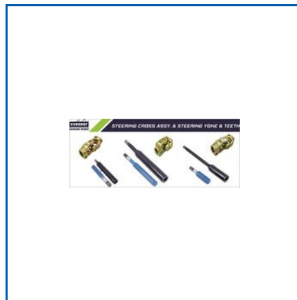
STEERING CROSS ASSEMBLY