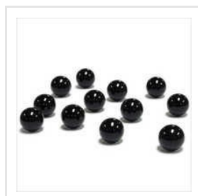
Black Glass Ball