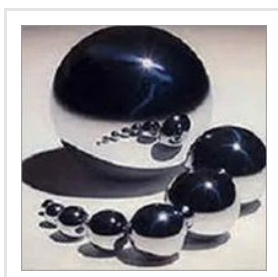
Carbon Steel Balls