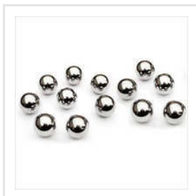
AISI 304L Stainless Steel Ball