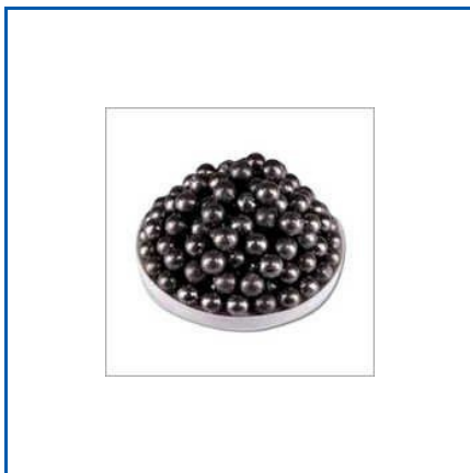
GRINDING MEDIA BALLS

AISI 304L Stainless Steel Ball, AISI 316L Stainless Steel Ball, AISI 420C Stainless Steel Ball, AISI 440C Stainless Steel Ball, AISI S-2 Tool Steel Roller, Bearing Balls, Black Glass Ball, Carbon Steel Balls, Ceramic Balls, Chrome Steel Balls, Copper Balls, Cycle Bearing Balls, Glass Balls, Grinding Media Balls, High Carbon Chrome Alloy Ball, etc.