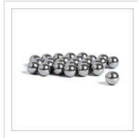
Tool Steel Balls