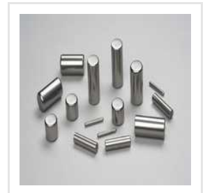
AISI S-2 Tool Steel Roller