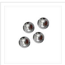
AISI 420C Stainless Steel Ball