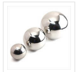
AISI 316L Stainless Steel Ball