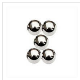
Stainless Steel Bearing Ball