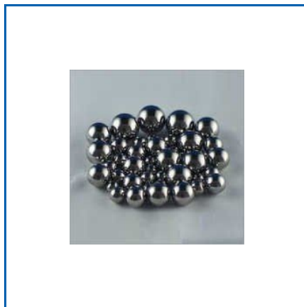
STAINLESS STEEL BALLS