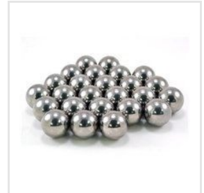
Tungsten Carbide Balls