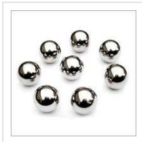
Chrome Steel Balls