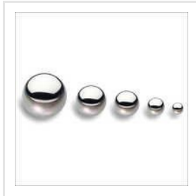
Tungsten Carbide Precision Balls