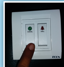
Wall mounted Bs1

Information is sent to fixed control posts, computers and wireless terminals. This enables communication between patients and nurses regardless of location, thus optimizing the work of the nursing staff.