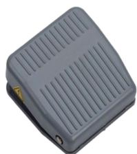
Foot operated Fb1