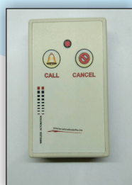
Wearable pendant Wb1