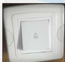
Wall mounted Call switch Cb1