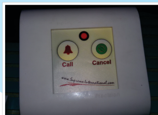
Bed side unit