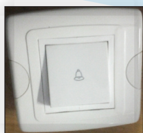
Wall mounted Call switch