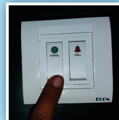
Bed side unit