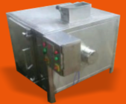
Dryer 48 Tray