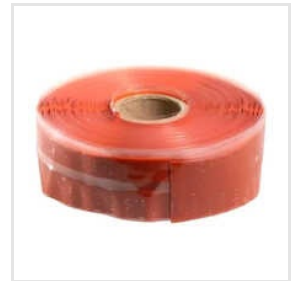
Silicone Adhesive Tape