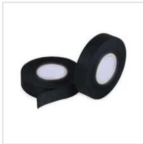
Industrial Adhesive Tape