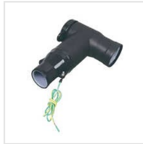
Touch Proof Screen Connector