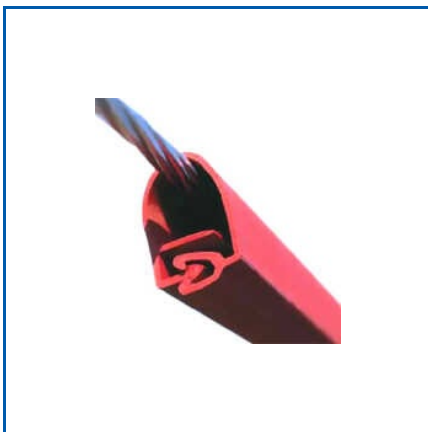
OVERHEAD LINE COVER

Adhesive Lined Heat Shrink Tube, Barcode Label Printer, Barley Fish Paper, Busbar Insulation Tape, Corrugated Breathing Tubes, Corrugated Tube, EPR Self Amalgamating Tape, Electrical Insulation Sleeve, Electrical Insulation Tape, Expandable Braided Sleeve, Ferrule Heat Shrink Printable Sleeve, Forklift Battery Connector, Heat Shrinkable PTFE Sleeve, Heat Shrinkable Sleeve, Heat-Shrinkable Fabric Tube, etc.