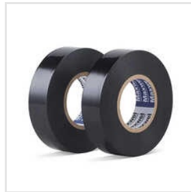
Electrical Insulation Tape