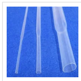
Heat Shrinkable PTFE Sleeve