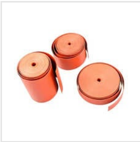
Busbar Insulation Tape