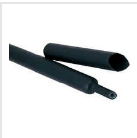
Adhesive Lined Heat Shrink Tube