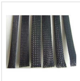
Expandable Braided Sleeve