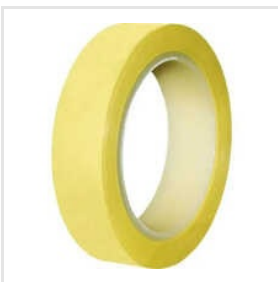
Polyester Adhesive Tape