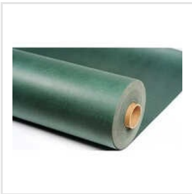
Barley Fish Paper