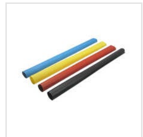
Heat Shrinkable Sleeve