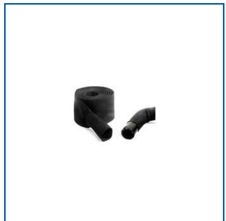
HEAT-SHRINKABLE FABRIC TUBE