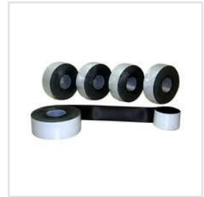
EPR Self Amalgamating Tape