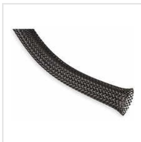
Nylon Braided Sleeve