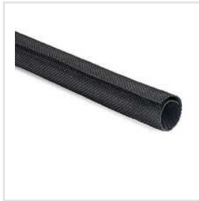
Self Closing Wrap