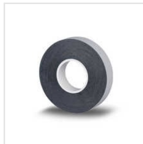
Self Amalgamating Rubber Tape