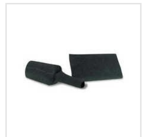
Textile Shrink Tube Sleeve