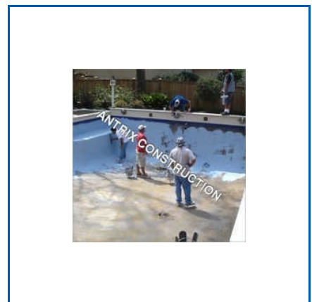
TURNKEY PROJECT WATERPROOFING SERVICES