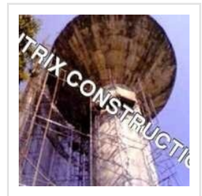
Water Tank Waterproofing Service