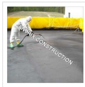
Swimming Pool Waterproofing