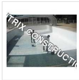
Swimming Pool Waterproofing Service