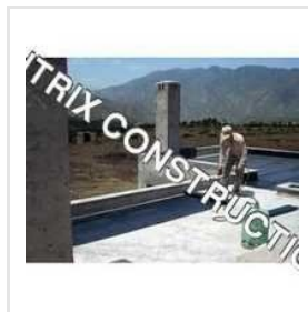
Terrace Waterproofing Service