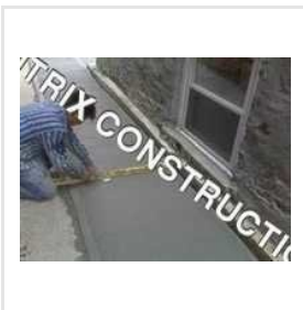
Concrete Waterproofing Service