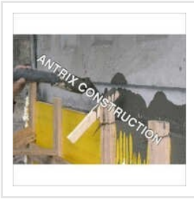
Waterproofing Chemicals Services