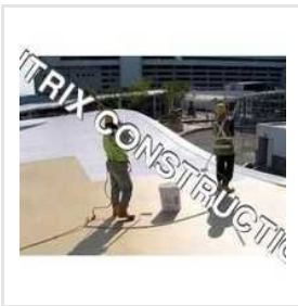
Waterproof Sealant Service