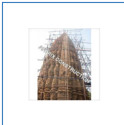
TURNKEY CONSTRUCTION PROJECTS SERVICES