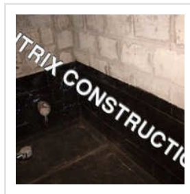
Bituminous Water Proofing Service