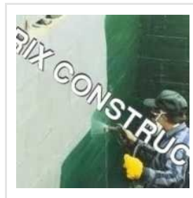
Polymer Waterproofing Service