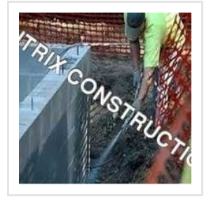
Commercial Waterproofing Service