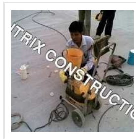
Injection Water Proofing Service