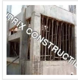
Crystalline Water Proofing Service