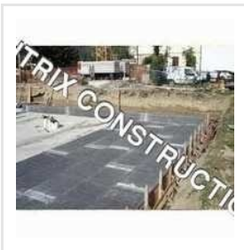
Bentonite Water Proofing Service