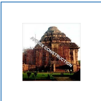
HERITAGE RESTORATION SERVICES

Acrylic Seamless Membranes Waterproofing Service, Balcony Waterproofing Service, Basement Wall Waterproofing Service, Basement Waterproofing Service, Bentonite Water Proofing Service, Bituminous Water Proofing Service, Building Renovation Service, Building Repair Service, Building Restoration Services, Chemical Coating Services, Chemical Coating Solution, Civil Contract Service, Civil Contracting Services, Civil Contractor Services, Civil Works Projects Service, etc.