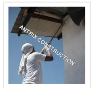
Exterior Painting Services