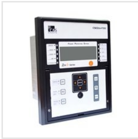
Advance Feeder Protection & Directional Overcurrent Relay