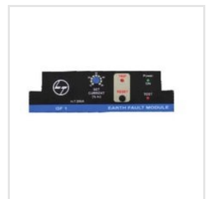
Ground Fault Module