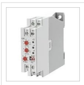
Frequency Monitoring Relay Series