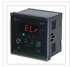
Earth Leakage Relay