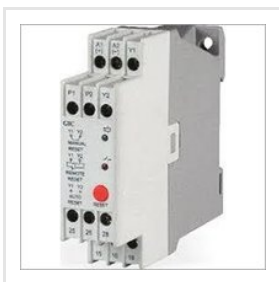
PTC Thermistor Relay