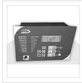
Engine Control Relay