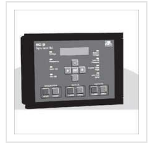
EC 2 AMF Relay