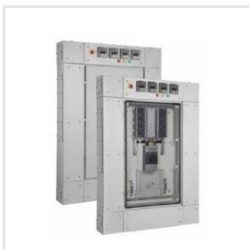
SMDBs For Power Distribution