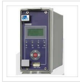
Directional Overcurrent Relay