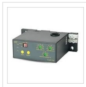
Current Monitoring Relay