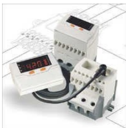
ELECTRONIC MOTOR PROTECTION RELAY

2 pin socket, 32A Switch Disconnecter, 4 Pole isolators, AC Drive, ACE 2 MCCB, AMF Relay, APFC Controller, Accessories for Air circuit Breaker, Accessories for DU/DY MCCB, Accessories for MCCB – CSC Series, Accessories for Switch Disconnecter fuse, Accessories for robuTa and Exceed Contactors, Accessories for surge Suppressors, Accessories of C-POWER Air Circuit Breakers, Accessories of OMEGA Air Circuit Breakers, etc.