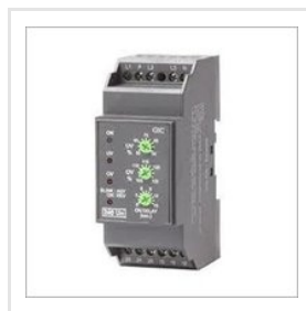
Voltage Monitoring Relay Series