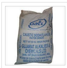
Caustic Soda Flakes