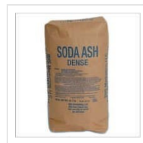
Soda Ash Dense