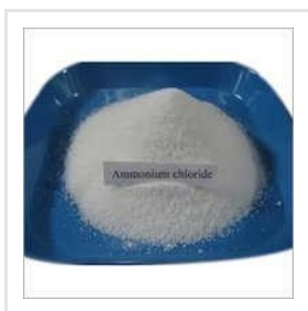
Ammonium Chloride Powder