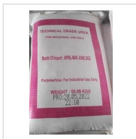
Urea Prilled Industrial