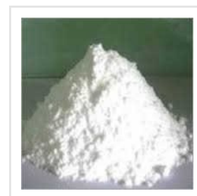
Alum Non Ferric