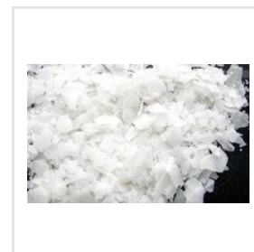
Caustic Soda Flakes (GACL Meghmani)