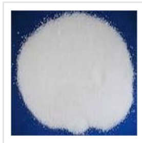
Potassium Chloride Technical Grade