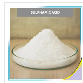
Sulphamic Acid Descalant Grade