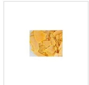
Sodium Sulphide Flakes