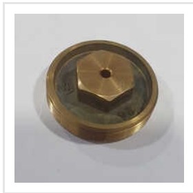
Brass Parts For Industrial Use