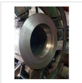
Metal Components Job Work Services