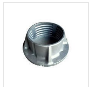
Ductile Iron Casting