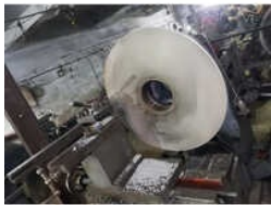
PRECISION ENGINEERING JOB WORK SERVICES

316 Stainless Steel Hub Flange, 750mm Check Valve Casting, Aluminium Casting Job Work Services, Aluminium Pressure Die Casting, Black Cast Iron Casting, Brass Parts Casting, Brass Parts For Industrial Use, Brass Shell Core Casting, Cast Iron Bearing Housing, Cast Iron Gate Valve, Cast Iron Machined Parts, Cast Iron Medium Pressure Job Work Services, Casting Job Work Services, Cold Forging Parts, Ductile Iron Casting, etc.