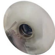
ALUMINIUM CASTING JOB WORK SERVICES