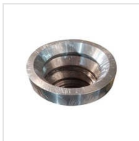
Stainless Steel 316 Casting