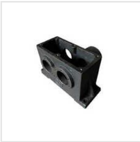
Black Cast Iron Casting