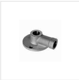
Investment Casting Components