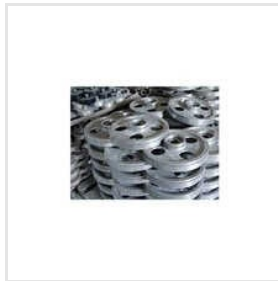
Cast Iron Medium Pressure Job Work