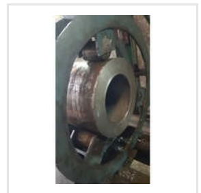
Casting Job Work Services