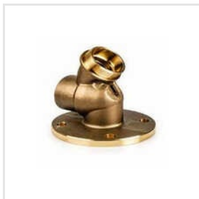
Brass Parts Casting