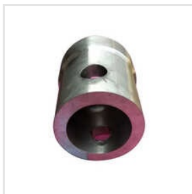
Stainless Steel 316 Casting