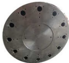
HEAVY MACHINING JOB WORK SERVICES