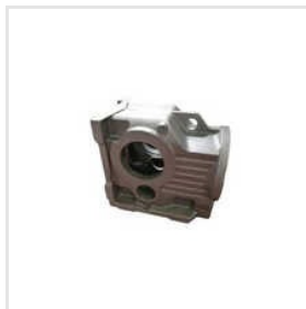
Rotavator Gearbox Housing