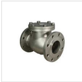
750mm Check Valve Casting