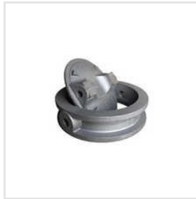
Investment Valve Castings