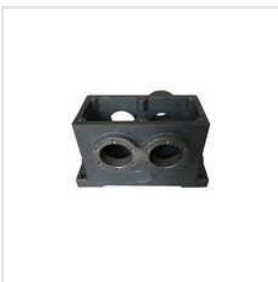
Gray Sand Iron Casting