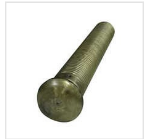
Ms Turning Shaft Machining Job Work