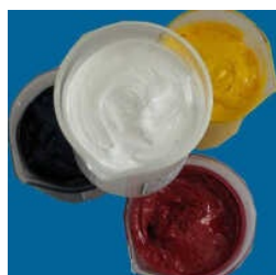
Textile Printing Binders