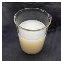
Cationic Polyethylene Emulsion