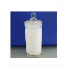
ANTI BACK STAINING

Acrylic Binder, Acrylic Dispersant, Acrylic Polymer, Acrylic Waterproofing Polymer, Activated Dimethicone Emulsion USP, Activated Dimethicone IP-BP-USP, Anti Back Staining, Antifoam NXZ, Cationic Polyethylene Emulsion, Construction Chemicals, Defoamer SIL, Dyeing And Printing Auxiliaries, Dyeing Chemicals, Emulsifiers for Stainers, Fabric Softener, etc.