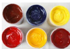
TEXTILE PRINTING PASTE