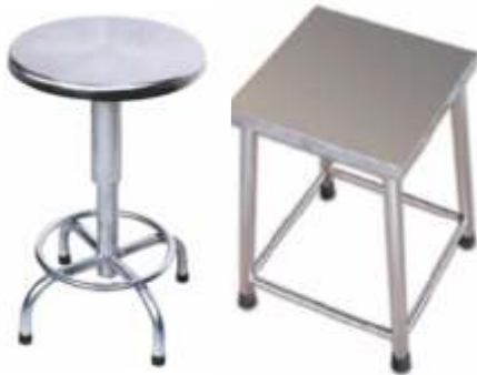
STAINLESS STEEL STOOL