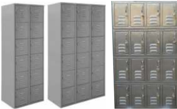
S.S. LOCKER WITH DOOR