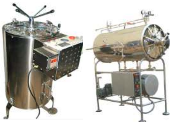
AUTOClave - VERTICAL/HORIZONTAL