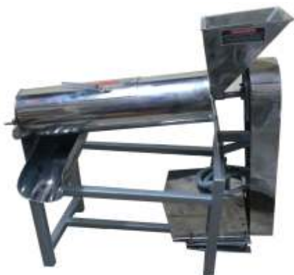
PULPER - GMP MODEL