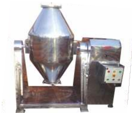
DOUBLE CONE MIXER