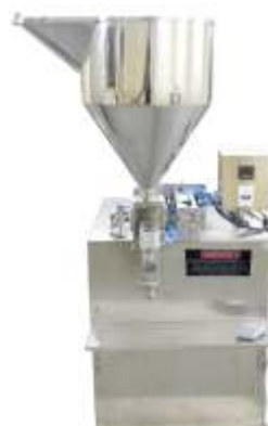
CHAVANPRASH FILLING MACHINE