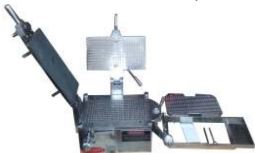
CAPSULE FILLING MACHINE 100/300 HOLE