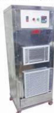
DEHUMIDIFIER – GMP Model