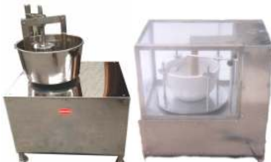
KHARAL - ST. STEEL/PROCELAIN