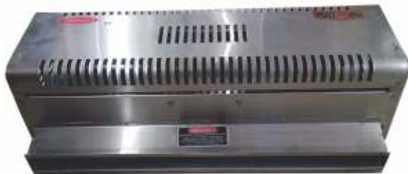
AIR CURTAIN – (S.S / M.S)