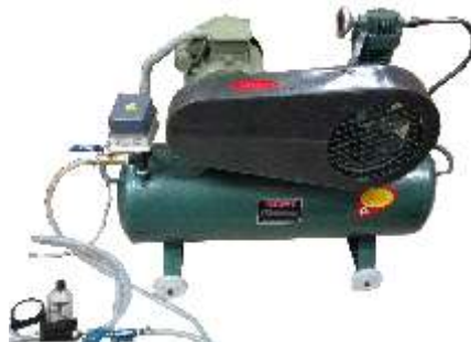
For Cleaning of Poly Empty Bottles