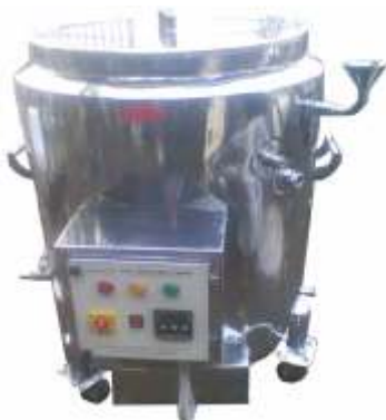
Available Cap: - 50 ltr to 1250 ltr.