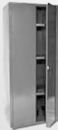
Change room Cupboard