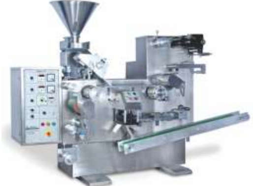
Model - Single Track/Double Track