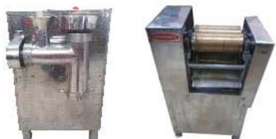
STICK/PILLS MAKING MACHINE