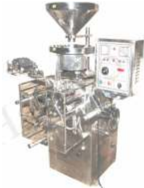
Available in 2 Track & 4 Track