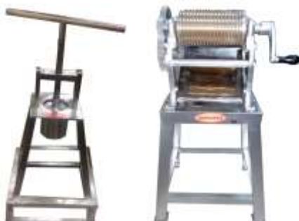
STICK/PILLS MAKING MACHINE