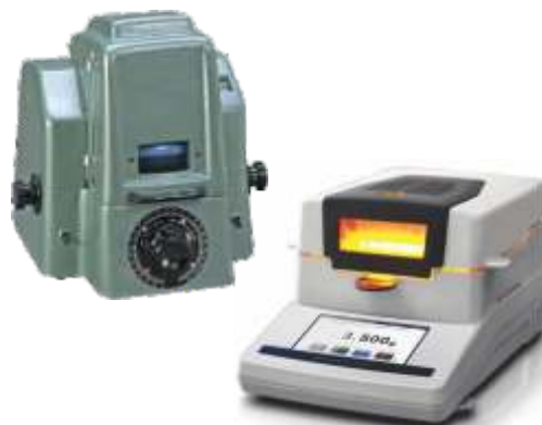
MOISTURE ANALYZER/ BALANCE