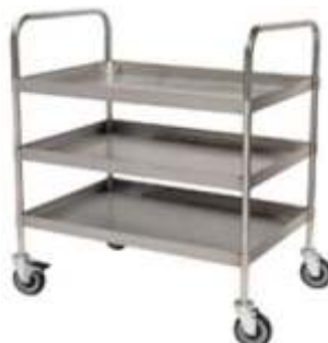
MULTI PURPOSE TROLLEY