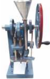
Hand Operated - Single Punch