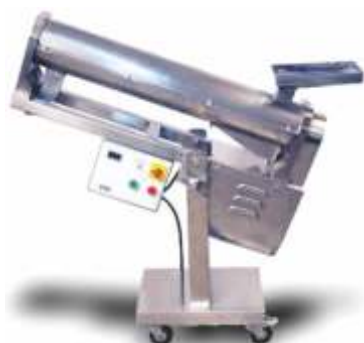
CAPSULE POLISHING MACHINE