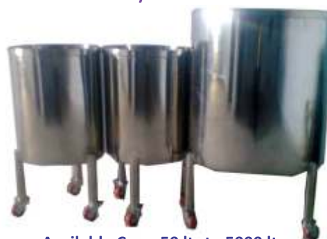
Available Cap:- 50 ltr to 5000 ltr.