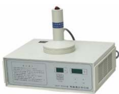
Available Model upto 35mm & 135mm cap size