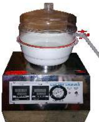
LEAK TEST APPARATUS