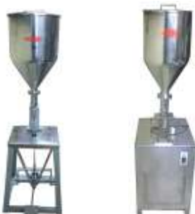
OINTMENT FILLING MACHINE

Foot Operated Semi Automatic Available Cap:- 5gm to 500gm