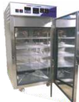
HUMIDITY/ STABILITY CHAMBER