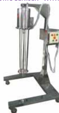
Available Cap: - 50 liter to 500 liter