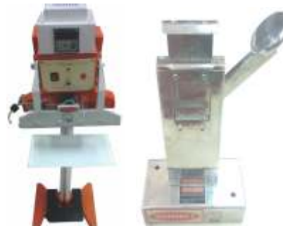
TUBE SEALING & BATCH NUMBERING MACHINE

Foot Operated Semi Automatic Available Cap:- 5gm to 500gm