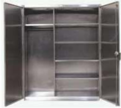
CHANGE ROOM CUPBOARD