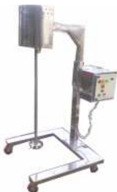
Available Cap:- 50 liter to 1000 liter