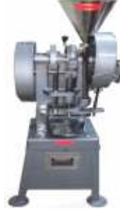
Motorised - Single Punch