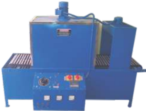
Available Automatic tunnel Model