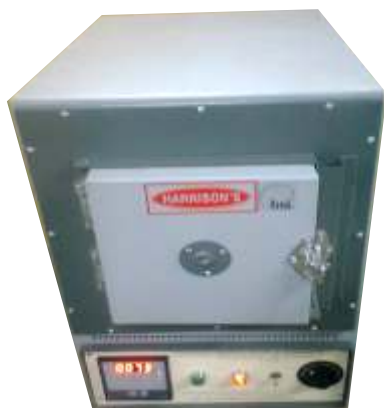
MUFFLE FURNACE - RECTANGULAR