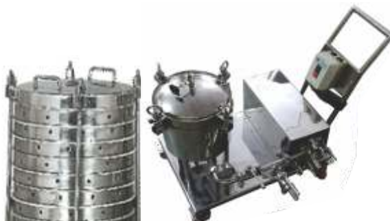
Available Model: 8"dia, 14"dia & 18"dia.