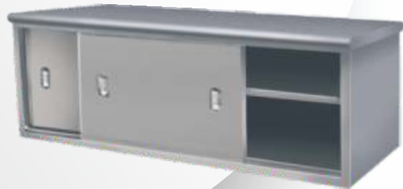
Cross over Bench With Almira