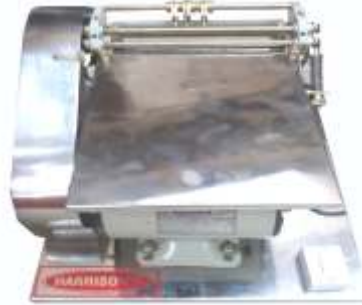
Available in 6" & 12" roller