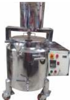
Available Cap: - 50 ltr to 1250 ltr.