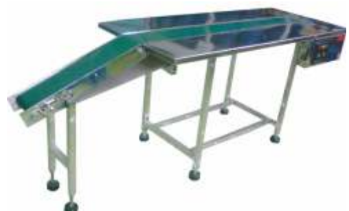
Length as per your requirement