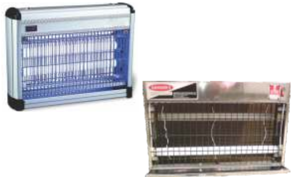
INSECT KILLER (Insect O Kill)