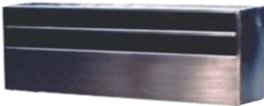
CROSS OVER BENCH