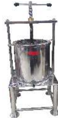
TINCTURE PRESS – GMP MODEL