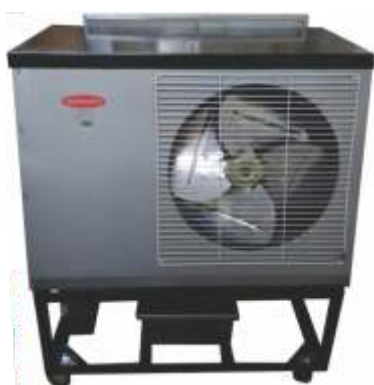
DEHUMIDIFIER - Standard Model