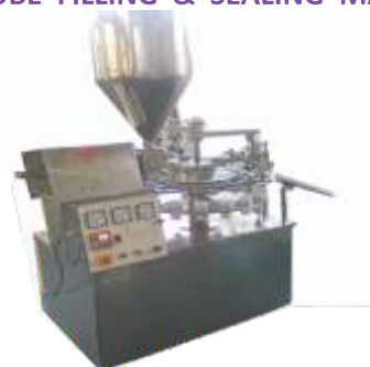
LAMI TUBE FILLING & SEALING MACHINE