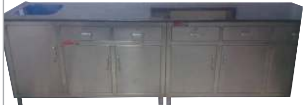
LAB UNDER COUNTER