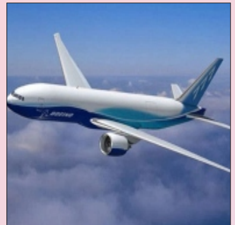
Air Freight Services