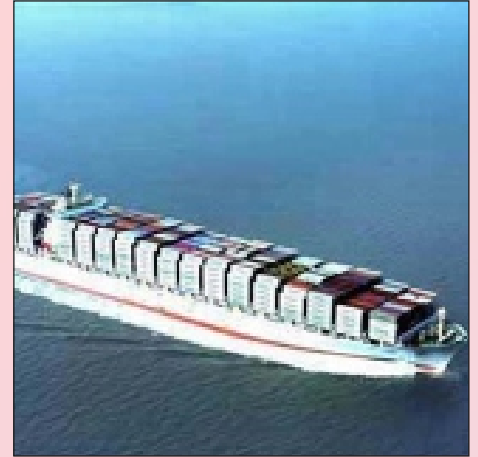
Sea Cargo Freight Forwarding Services