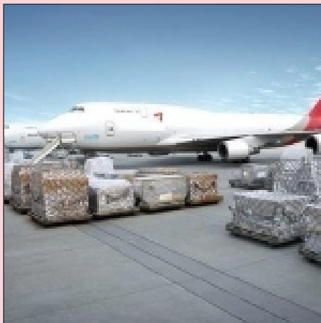
Air Freight Forwarding Services