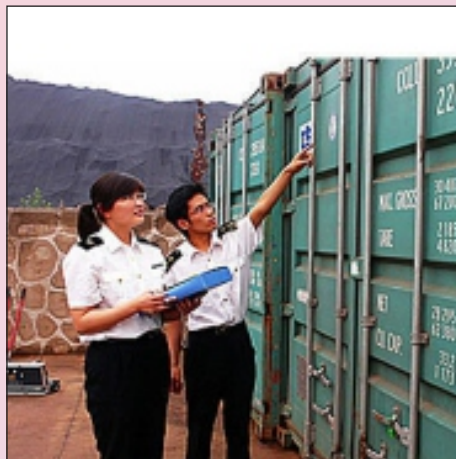
Customs Brokerage Services