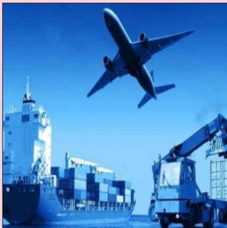
International Import Freight Services