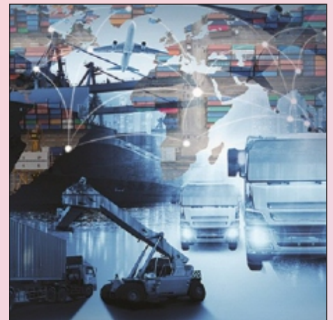
Custom Clearance Of Import Cargo Services