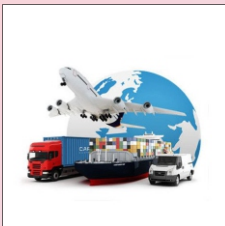
Import Cargo Transportation Service