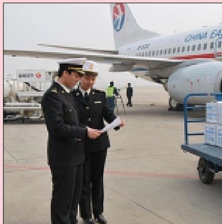
Import Clearance Services