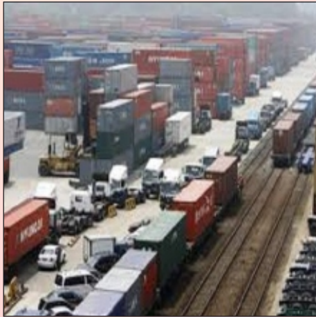
Customs Clearance Brokerage