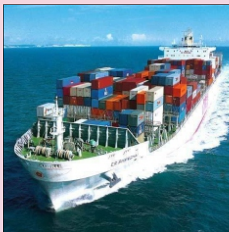
International Shipping Services