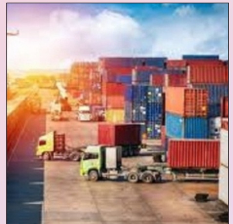
Customs Clearing And Brokerage Agent Service