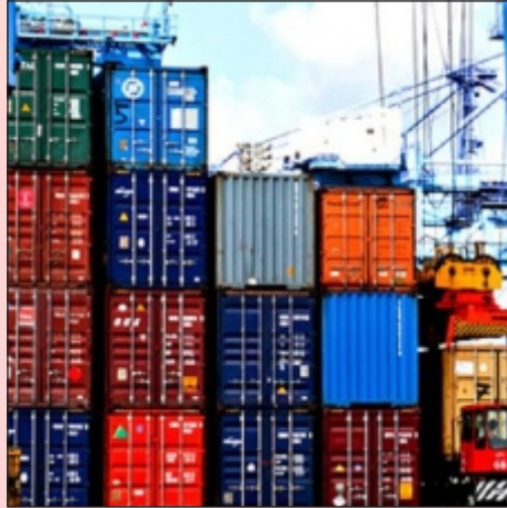
Cargo Container Freight Forwarding Services