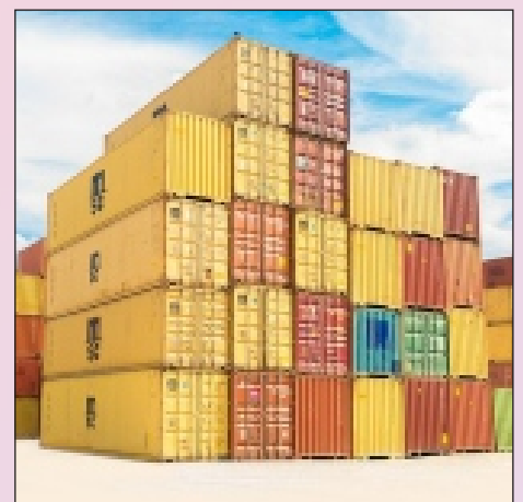
LCL & FCL Cargo Transportation Services