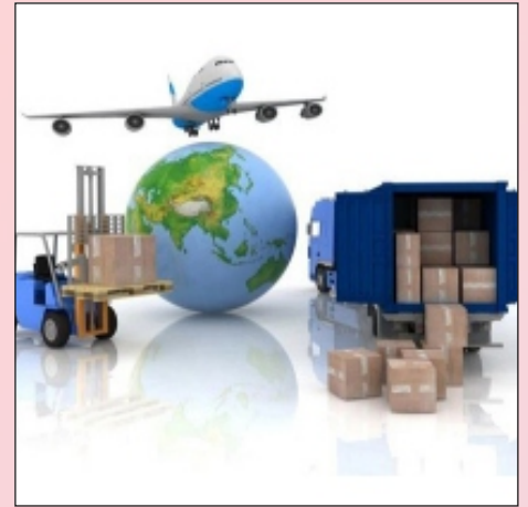
Custom House Brokerage Agent Services