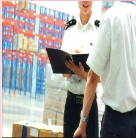
International Custom Cargo Brokerage Service