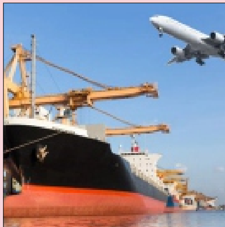
Cargo Ships Freight Forwarding Services