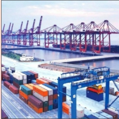
Freight Forwarding Services