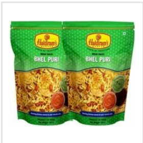
Bhelpuri And Snacks Mix Pouches