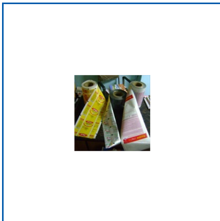
FLEXIBLE PACKAGING MATERIALS

3 Side Seal Pouches, Aluminium Pouches, Bhelpuri and Snacks Mix Pouches, Cashew Pouches, Center Seal Tea Pouch, Centre Seal Pouch, Centre Seal Pouches, Chocolate Pouch, Dal Pouches, Drain Cleaner Pouch, Flexible Packaging Materials, Frozen Foods Pouch, Gazette Pouch, Gusseted Pouches, Idli Dosa Batter Pouches, etc.