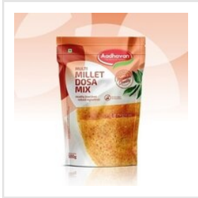
Sprouts Packaging Pouches