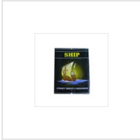
Centre Seal Pouch