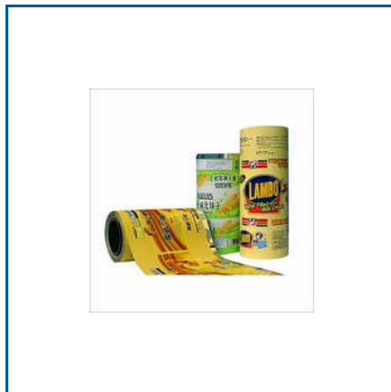
PRINTED LAMINATED ROLLS