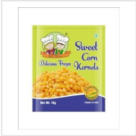
Frozen Foods Pouch