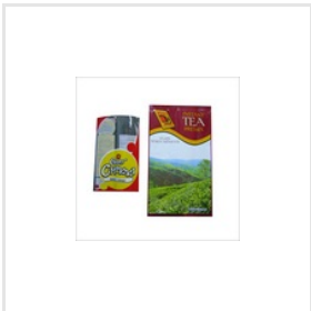
Center Seal Tea Pouch