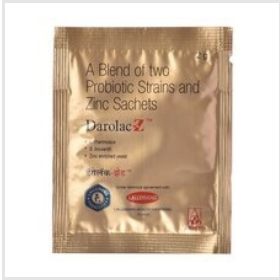
3 Side Seal Pouches