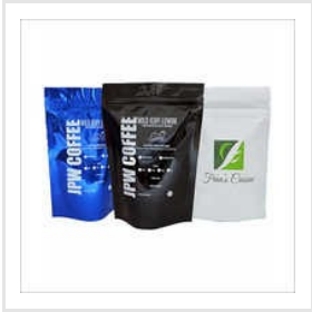
Stand Up Pouches