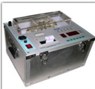
Insulating Oil Testers