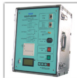
Tan Delta Tester