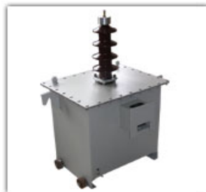
HV, Primary - Secondary current injectors