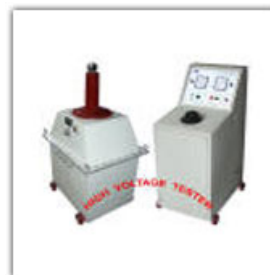
H. V. Testers 3 to 100 kV AC