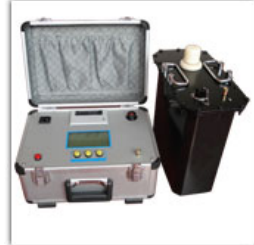
VLF AC Hipot Testers