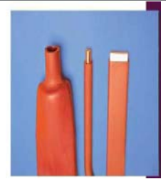
Busbar Insulating Sleeve