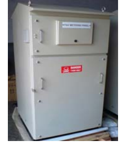
HT Metering Panels