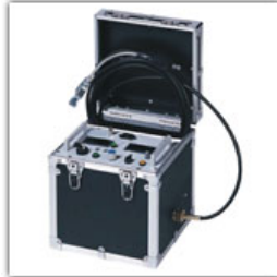
DC High Voltage Testers