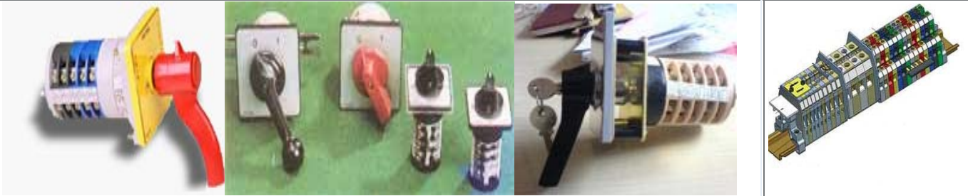
Rotary/Breaker Control/Toggle/Limit/Special purpose switches