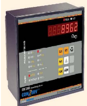
Digital panel Meter