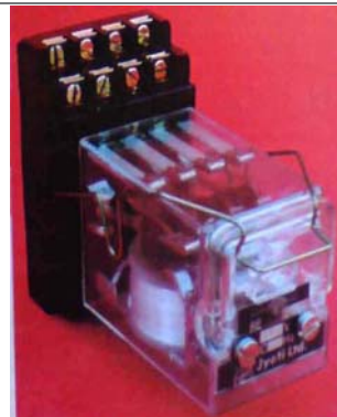
Jyoti make Aux Relay