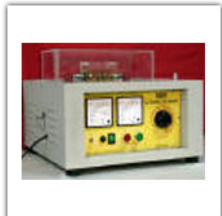
H.V. Tester Cum Oil Test Set