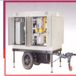
Transformer Oil Filtration Plant