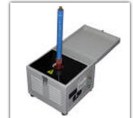
H.V. TESTERS (Hi-pots) AC/DC (2 in 1)