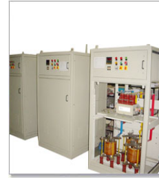
Soft Starters Panel