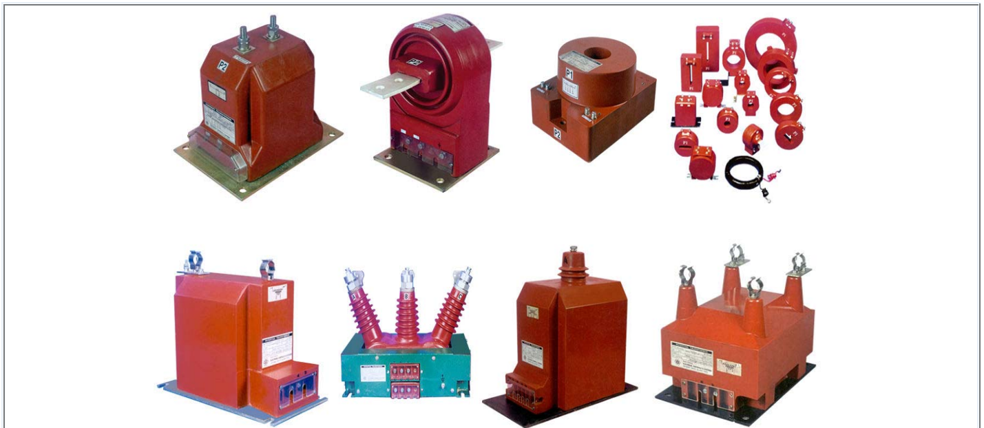
Epoxy Resin Cast MV Voltage/LT CTs/PTs for Metering/Protection/Special purpose

We are regularly supplying all type of Electrical Engineering products to Gulf countries since last 6 years & repeated orders are coming from most of our regular customers. Some of the product, which we are dealing as under :