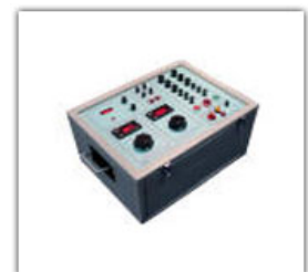
Relay Testing kit Sec. Current Injector