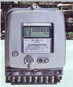
Secure/ABB/HPL make Energy Meters