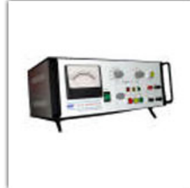
Million Meg Ohm Meter