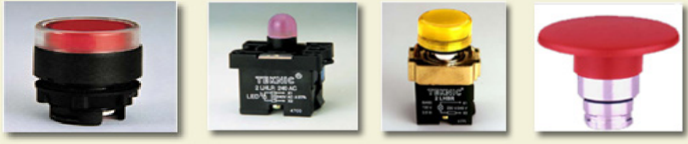
LED indicating Lamps/Push Buttons/Actuators