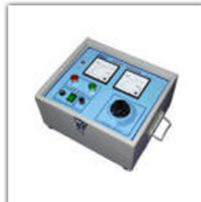
H. V. Testers 30 kV DC