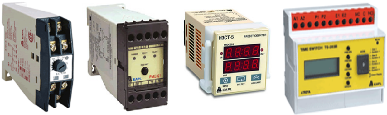
EAPL Timers/Counters/Time Switches/Monitoring Devices