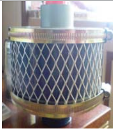
Silica Gel Breather