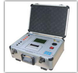
Transformer Turn Ratio Tester