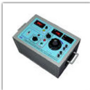
Primary Current Injector