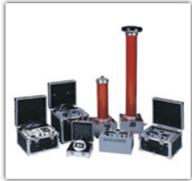
DC High Voltage Testers HIPOTS