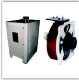
Cont. Variable Vol Auto Transformers