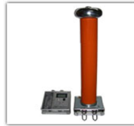
Universal Voltage Dividers