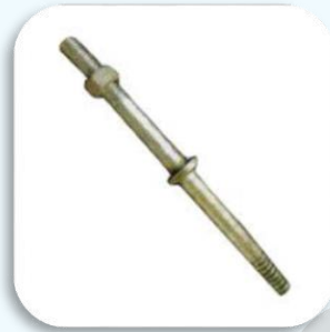
LT PIN 6"