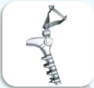
4 BOLT B&S