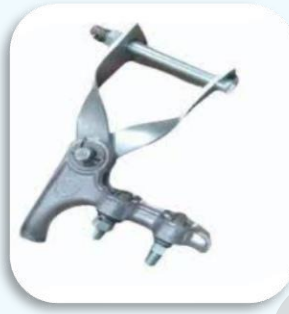
2 BOLT T&C