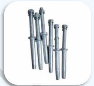
LT PIN 10.5"