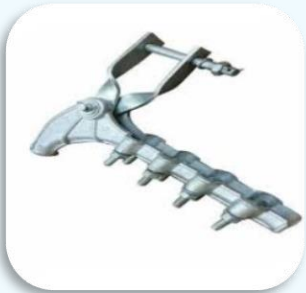
4 BOLT T&C