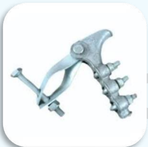
3 BOLT B&S