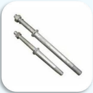
11 KV GI PIN