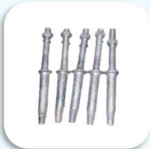
33 KV GI PIN