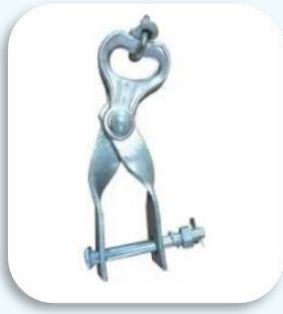
SINGLE BOLT B&S