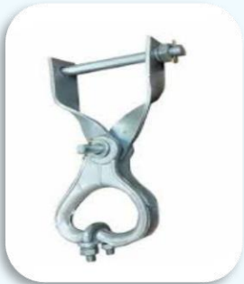
SINGLE BOLT T&C