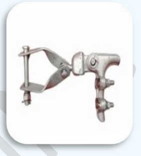
2 BOLT B&S