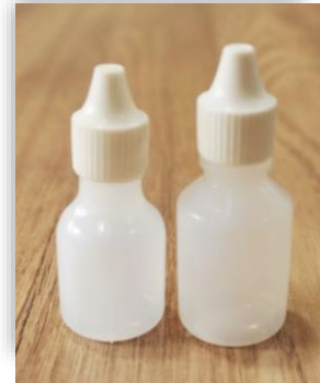
Eye- Drop Bottles