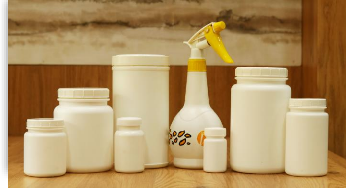
Storage Wide-mouth Jars