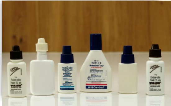
Betadine & Wokadine Powder Bottles (5gm & 10gm)