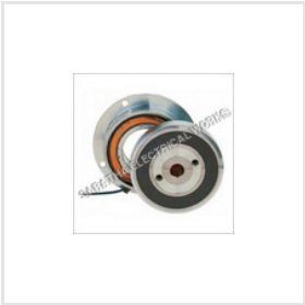
Electro Magnetic Clutches