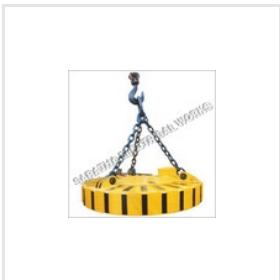
Circular Lifting Magnets