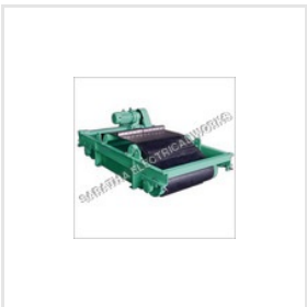
Over Band Electro Magnetic Separators