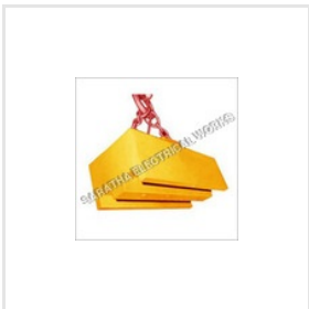
Rectangular Plate Magnets