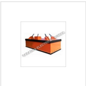
Rectangular Lifting Magnet