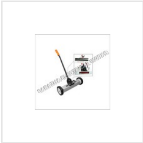
Magnetic Floor Sweeper