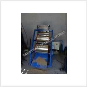
Magnetic Drum Separator