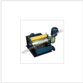
Magnetic Coolant Separator