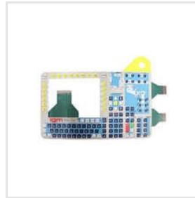
Customized Membrane Keypads