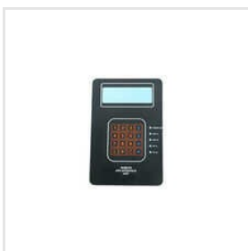
Remote UPS Interface Unit