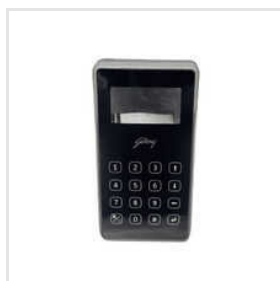
Lock Membrane Keypads