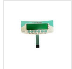
Accuratio Membrane Keypads