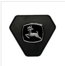
Customized Dome Labels