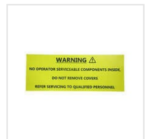
Customized Warning Signage Sticker