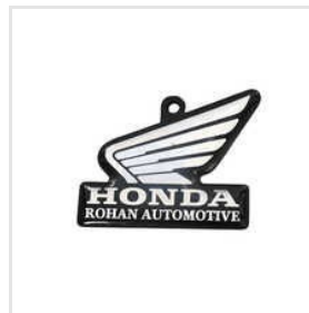
Honda Dome Labels