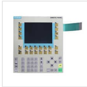
Simatic Panel Membrane Keypads