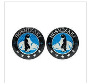
Hoshizaki Dome Labels