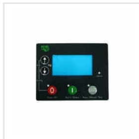
Screen Printed Graphic Overlays