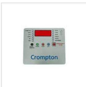
Crompton Screen Printed Graphic