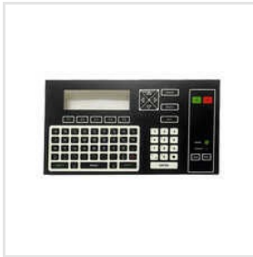
Machine Membrane Keypads