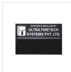
Customized Aluminium Name Plate