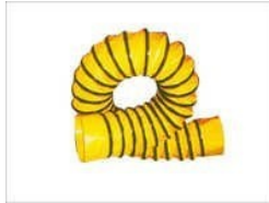
Spiral PVC Hose