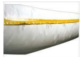
Pvc Duct With Continuous