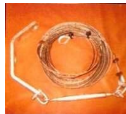
Overhead Wire Rope Assembly