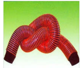
Toilet Cart Dump Hose Pipe