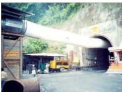
Flexible Tunnel Ventilation Duct