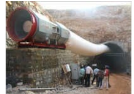
Tunnel Ventilation Fans