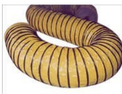
PVC SEMI RIGID DUCT