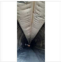
Elliptical PVC Duct