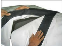
PVC Duct With Velcro Joints