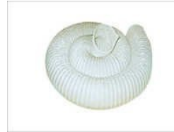
Flexible Hose Pipes