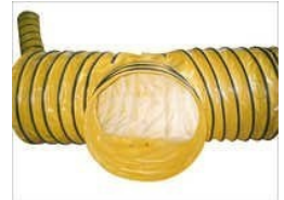
PVC Semi Rigid T Joints