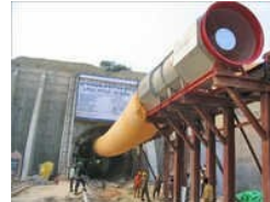
EOL Vent Fan With Blower Duct