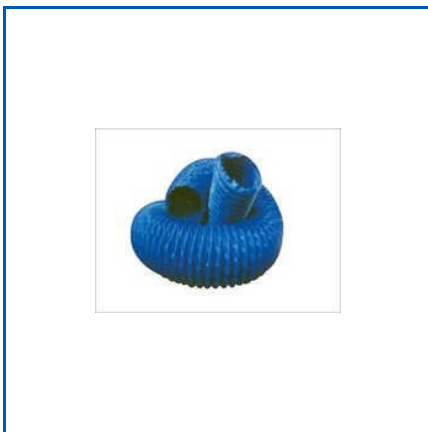
FLEXIBLE PVC HOSES

5 Mtr Silicone Hose, Antistatic PU Flexible Hose, Aviation Duct, Blower Duct, Blower Ducting, Compressed Ducting, Crush Proof Hoses, EOL Vent Fan With Blower Duct, EOL Ventsystem, Elliptical Duct, Elliptical PVC Duct, Flexible Hose Pipes, Flexible PVC Hoses, Flexible Tunnel Ventilation Duct, High Temperature Fabric Hose, etc.