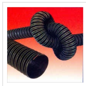
Two Ply Neoprene Hose