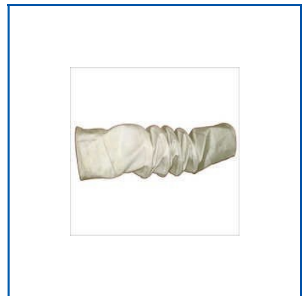
HIGH TEMPERATURE FABRIC HOSE