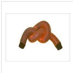
Toilet Cart Dump Hose