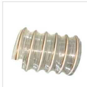
Antistatic PU Flexible Hose