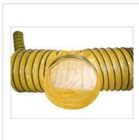
PVC Semi Rigid T Joints