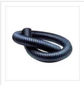
High Temperature Hose