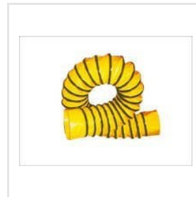
Spiral PVC Hose