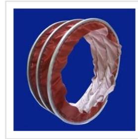
Silicone Clip Hose