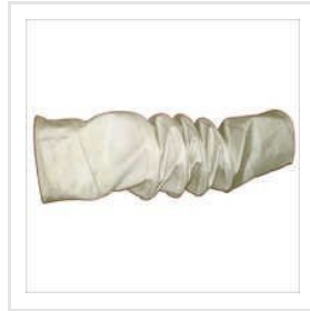
High Temperature Fabric Hose