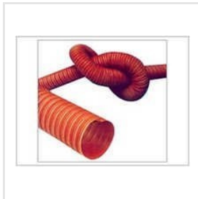
High Temperature Silicone Hose