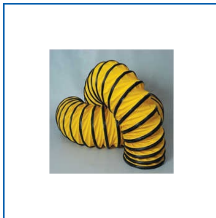
PVC FLEXIBLE SPIRAL HOSE