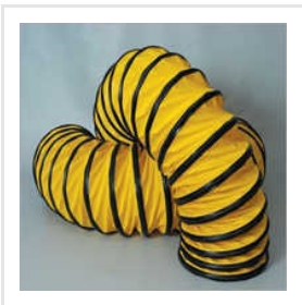
PVC Flexible Spiral Hose