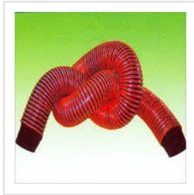
Toilet Cart Dump Hose Pipe