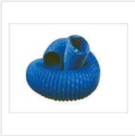
Flexible PVC Hoses