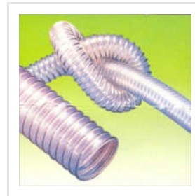
PVC Hose Pipe