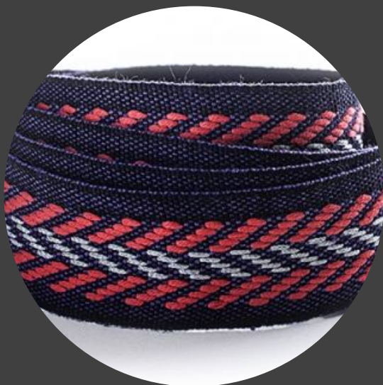
Narrow woven tape