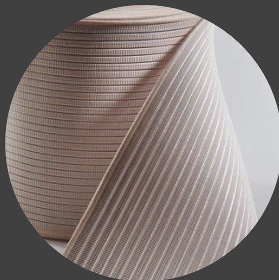
Orthopedic Elastic Tape