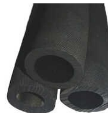
Rubber Airshaft Tube