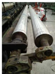
Sulzer Looms Whip Roll