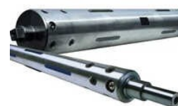
Mild Steel Air Shaft