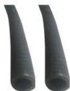
Rubber Air Shaft Tube