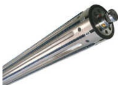
Multi Tube Air Shaft