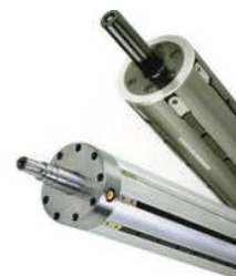
Mild Steel Multi Tube Air Shaft