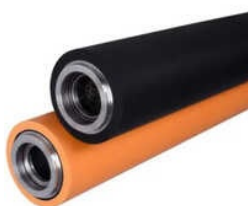
Industrial Printing Rubber Roller