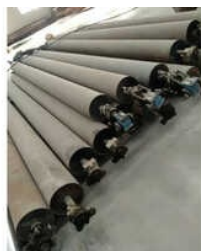
Sulzer Looms Winder Roll