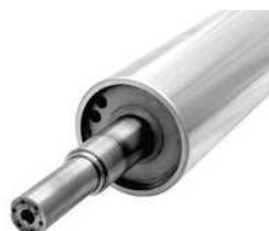
Mild Steel Roller