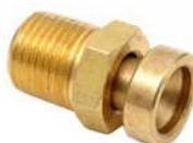
Brass Air Shaft Valve