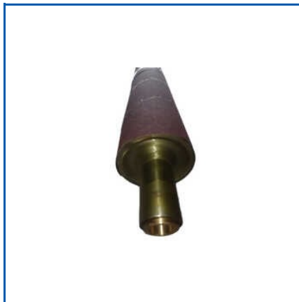
SULZER LOOMS HEMARI ROLL