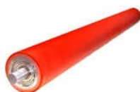
Silicone Rubber Roller