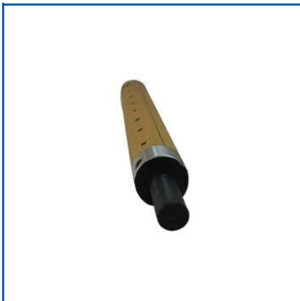
INDUSTRIAL MILD STEEL AIR SHAFT

Banana Rubber Roller, Brass Air Shaft Valve, Industrial Hard Chrome Roller, Industrial Mild Steel Air Shaft, Industrial Printing Rubber Roller, Mild Steel Air Shaft, Mild Steel Multi Tube Air Shaft, Mild Steel Roller, Multi Bladder Air Shaft Tube, Multi Tube Air Shaft, Printing Rubber Roller, Rubber Air Shaft Tube, Rubber Airshaft Tube, Rubber Expander Roll, Silicone Rubber Roller, etc.