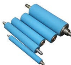
Solventless Lamination Rubber Rollers