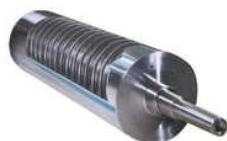
Spiral Cooling Jacket Roller