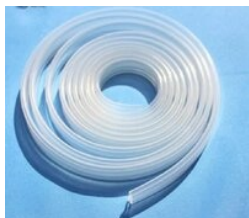
Multi Bladder Air Shaft Tube