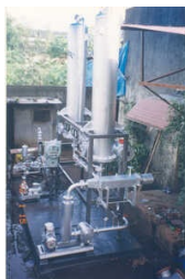
Skid Of Mol. Sieve Based Solvent Drying