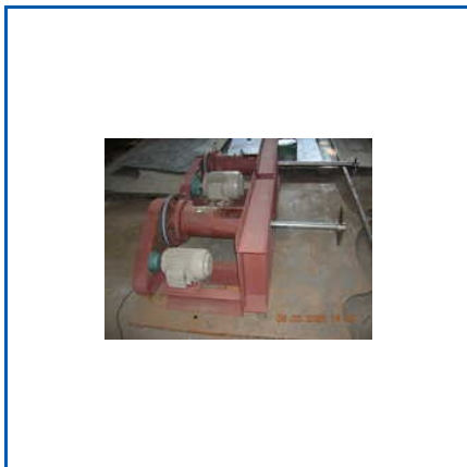
AGITATORS FOR HEAT TREATMENT FURNACE DUTY

10 Litre Electrically Heated Pilot Reactor for Hydrogenation, 12 Inch Ss Chromatography Column System With Top Adaptor Lifting Arrangement, 2 Litre Reaction System with Instant Heating, 25 Litre High Pressure Pilot Reactor for Polymer Industry, 2500 Litre Stainless Steel Pressure Vessel, 4 Inch Ss Chromatography Column System With Top Adaptor Lifting Arrangement, 6 Inch Glass Chromatography Columns, etc.