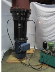
Bottom Mounted High Speed Agitator For