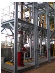
Distillation Skid For Bio Diesel Manufacturing