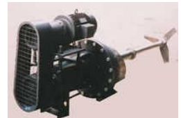
Side Entry Agitator