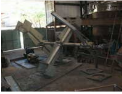
Agitator For High Viscosity Material