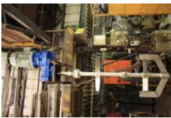
Multi Impeller Agitator