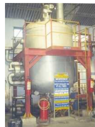
Reboiler Of Batch Distillation Unit