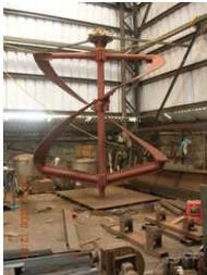
Agitator For Soap Preapration Vessel 50t