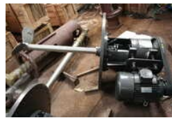
Side Entry Agitator