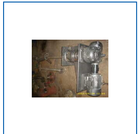
AGIATATOR FOR BITUMEN EMULSION SERVICE