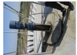
Central Agitator Installed On