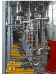
Distillation Skid For Bio Diesel Manufacturing