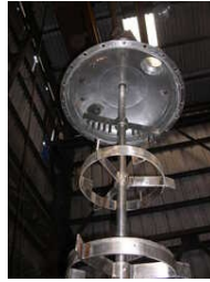
Multiple Impeller Agitator With Foam