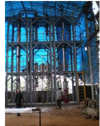
Distillation Skid For Bio Diesel Manufacturing