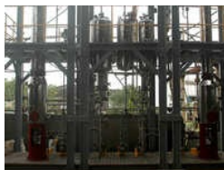
Distillation Skid For Bio Diesel Manufacturing