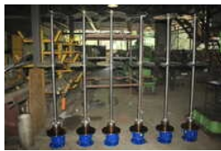
Multi Ple Agitators With Hydrofoil Impellers