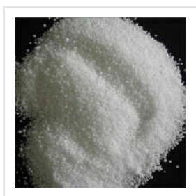
White Stearic Acid