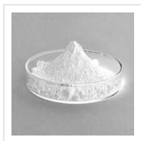
Zinc Oxide Powder