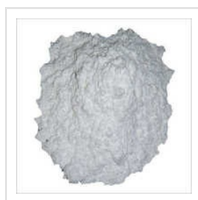
Calcium Carbonate Powder