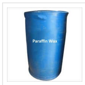
Liquid Paraffin Wax