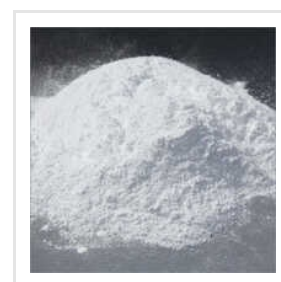
Calcium Stearate Powder