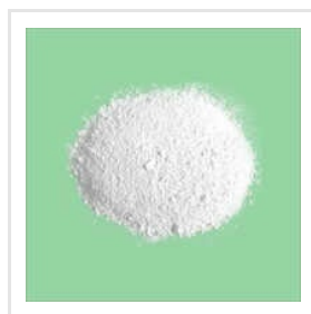
White Tribasic Lead Sulphate