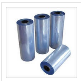
PVC Shrink Films