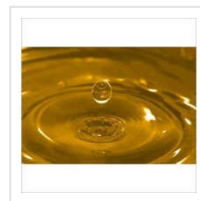
Industrial Epoxidized Soybean Oil