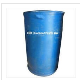
Chlorinated Paraffin Wax