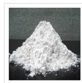
Hydrate Lime Chemical