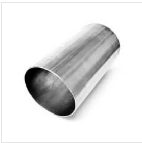
Steel Centrifugal Casting