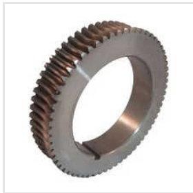
Alloy Steel Worm Gear Centrifugal Casting