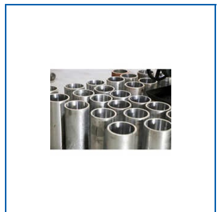
FERROUS SLEEVE LINERS CYLINDER CENTRIFUGAL CASTING