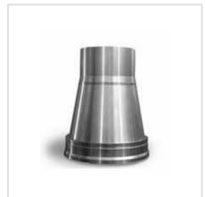
Vertical Centrifugal Casting