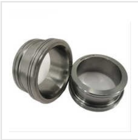
Exhaust Valve Seats Graded Centrifugal