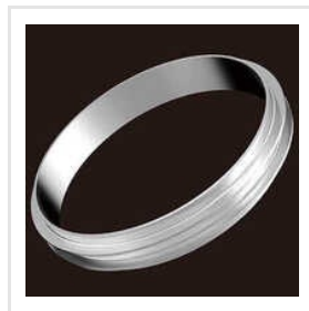
Larger Diameter Centrifugally Cast