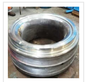
Exhaust Valve Seats Centrifugal Casted