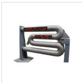
Radiant Tube Centrifugal Casting