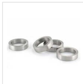
Hchr Forging Steel High Carbon High