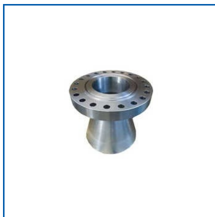
FLANGE CENTRIFUGAL CASTING