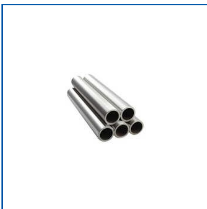
HK40 SS310 PIPE CENTRIFUGAL CASTING

Air Compressor Parts Casting, Alloy Steel Sand Casting, Aluminium Casting Components, Aluminium Valve Casting Components, Aluminum Valve Body Casting, Automobile Casting, Bicycles Parts casting, Centrifugal Casting Liner, Centrifugal Liners Casting, Centrifugal Sleeves Casting, Centrifugal casting Cylinder Liner, Centrifugal casting sleeve, Close Impeller Casting, Cylinder liner casting, Ductile Iron Sand Casting, etc.