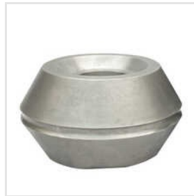
Vertical SS Centrifugal Castings