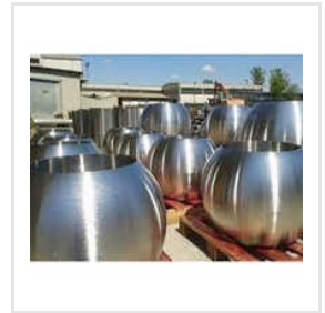
Stainless Steel Heavy Size Centrifugal