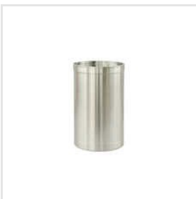
SS310 HK40 HN Liner Sleeve Centrifugal