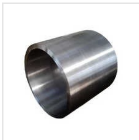
SS Cylindrical Centrifugal Casting