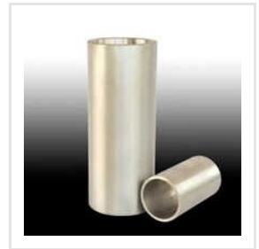
Alloy Steel Centrifugal Casting