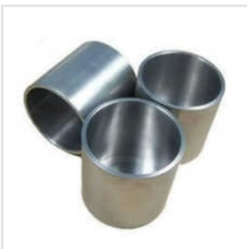
High Carbon High Chrome Centrifugal