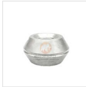
Stainless Steel Mono Roller