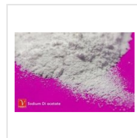
Sodium Di Acetate - Anhydrous Pharma