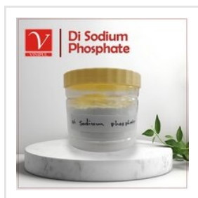
Di Sodium Phosphate