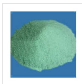
Ferrous Sulphate Anhydrous