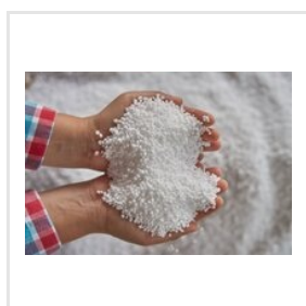
Phosphoric Acid 85%