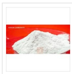
Sodium Carbonate (Soda Ash)