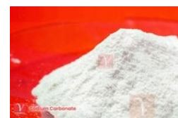
SODIUM CARBONATE MONOHYDRATE