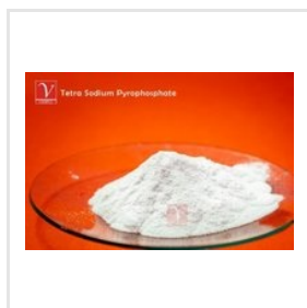
Tetra Sodium Pyrophosphate