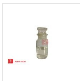
Acetic Acid 30% Water