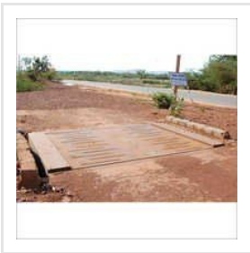
Portable Axle Weigh Bridge