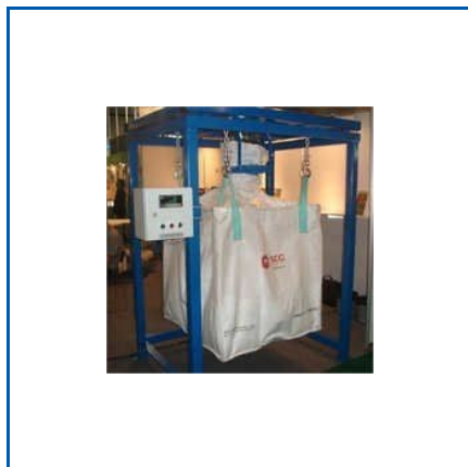
JUMBO BAG WEIGHER

3 In 1 Adult Weighing Scales, Accredited Laboratory Weights, Analytical Balance, Analytical Balance 201, Analytical Balance MAB220T, Analytical Balance Weight, Analytical Balance Weight box, Analytical Semi Micro Balance, Analytical Weight Box, Analytical Weight Box F1, Analytical Weights, Auto Bagging Machines, etc.