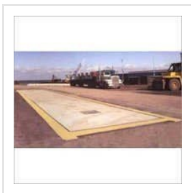
RCC Concrete Weighbridge