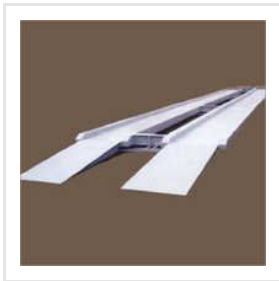
Mobile Weigh Bridge