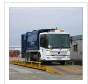
Modular Weigh Bridge