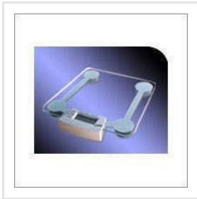
Portable Personal Scale