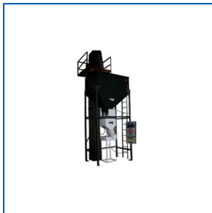
AUTO BAGGING MACHINES