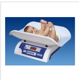
Baby Weighing Scale