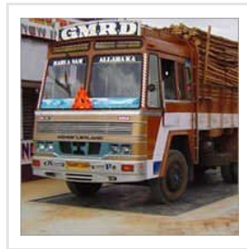
Pit Type Weigh Bridge