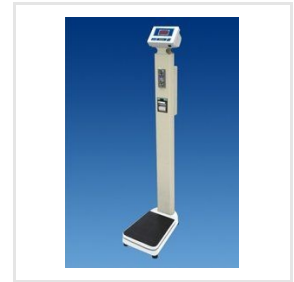
Body Weighing Scale