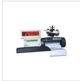
Weigh Bridge Conversion Kits