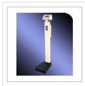
Personal Platform Scale