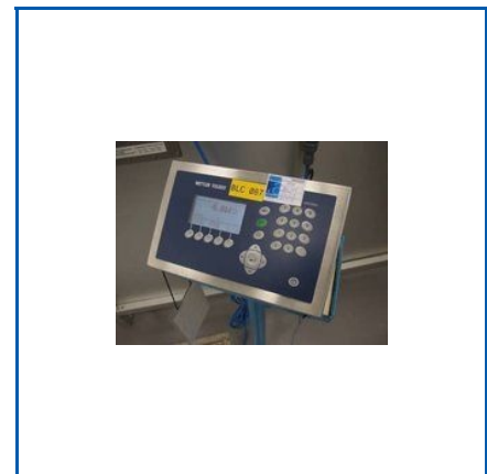
AUTO BATCHING SYSTEMS