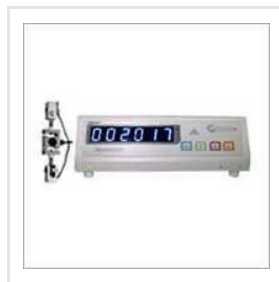
Weighbridge Conversion Kit