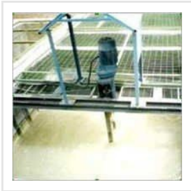
Water Treatment Agitators