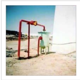
Biogas Treatment Moisture Traps