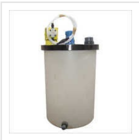
Chemical Dosing System