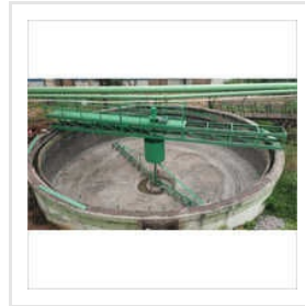
Industrial Wastewater Clarifier