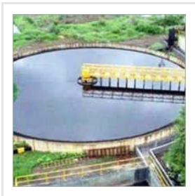
Incline Plate Clarifier