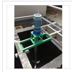
Industrial Wastewater Aerator