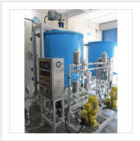
Industrial Dosing System