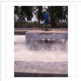
Industrial Fixed Aerator