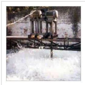
Industrial Water Aerators