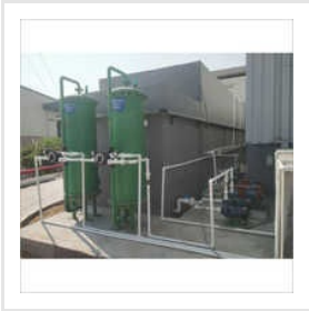
Industrial Effluent Treatment Plant