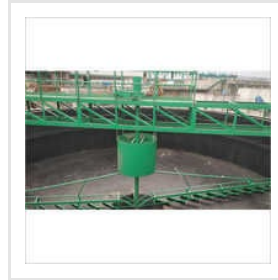
Commercial Waste Water Clarifier