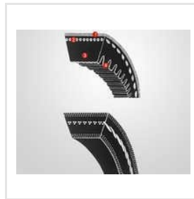
Raw Edge V Belts