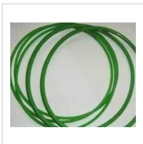
PU Round Belt