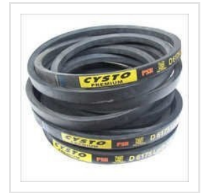
CYSTO V Belts