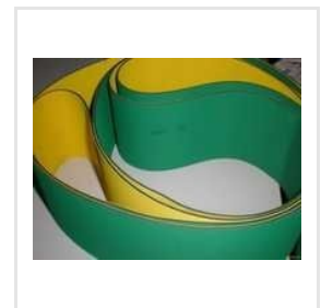
Nylon Sandwich Belts