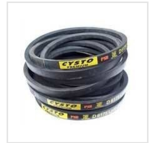
Classical V Belts