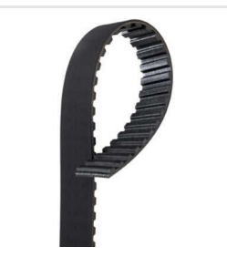
Auto Synchronous Belts