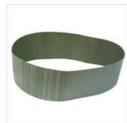
PU TIMING BELTS