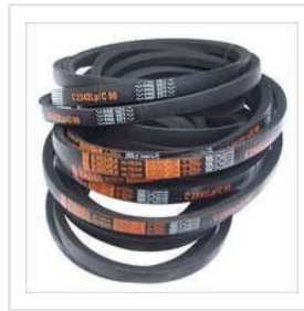
Heavy Duty V Belts