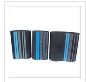
Industrial Timing Belts