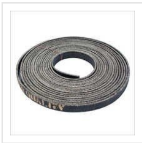
Heavy Duty Brake Lining