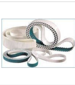
Polyurethane Timing Belt