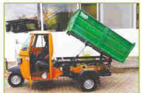
QEETP - 1.2 M 3