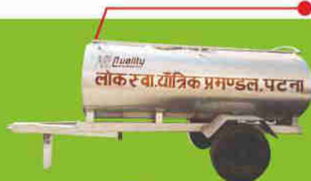
Model : QEEWTSS - 3LT