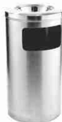
Code : QEE SS-40LP