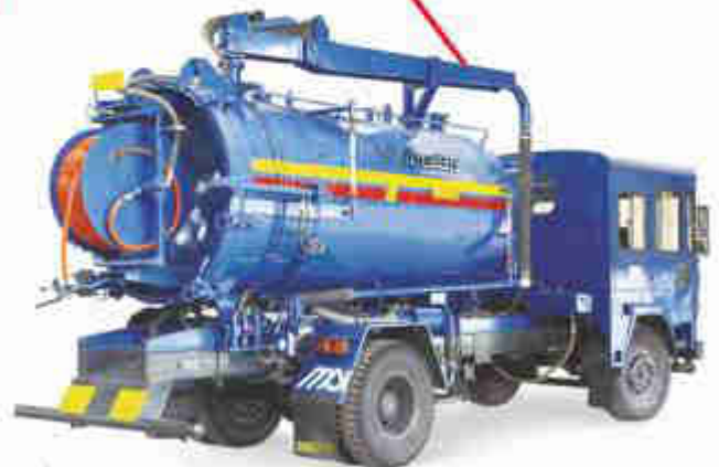
Model : QEESJM - 8LCH