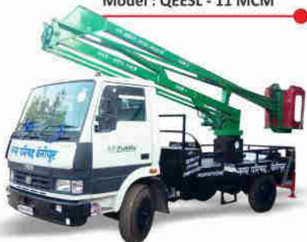
Model : QEESL - 11 MCM