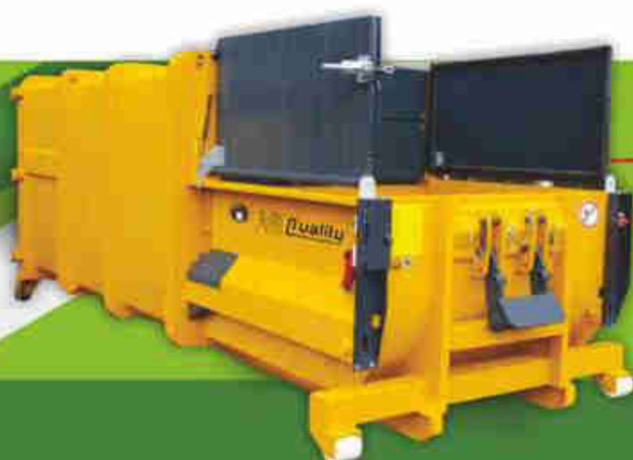
Model : QEEPC - 14M 3