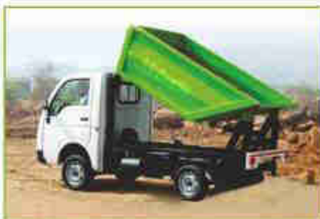
QEEHTP - 1.8 M 3