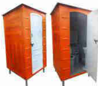
Model : QEEPT - 1STO