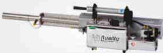
QEEFOG - 2000N