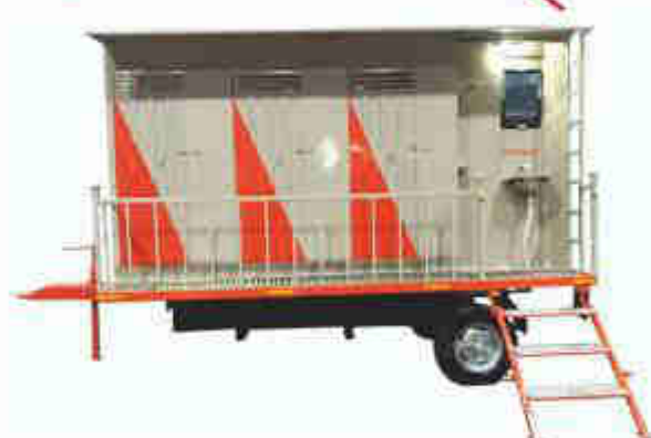
Model : QEEMT - 6STGI