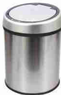
Code : QEE SS-40LD