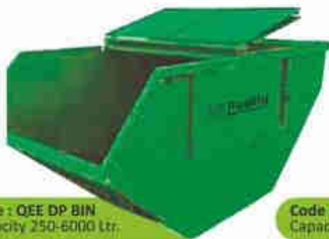
Code : QEE DP BIN Capacity 250-6000 Ltr.

As one of the leading entity of this domain, we are engrossed in providing supreme quality Dust Bin. The offered bin finds wide application use in hotels, offices, restaurants, malls, parks and other similar places for keeping the environment neat and clean. This bin is manufactured using quality materials and available in all different sizes to meet the requirements. Apart from this, clients can get the bin from us at reasonable rates.