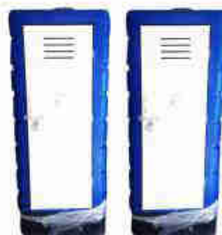
Model : QEEPT - 1STLLDPE