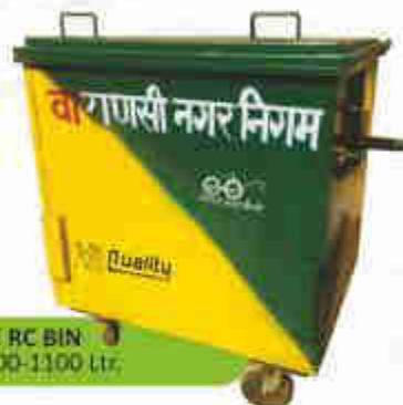
Code : QEE RC BIN Capacity 500-1100 Ltr.