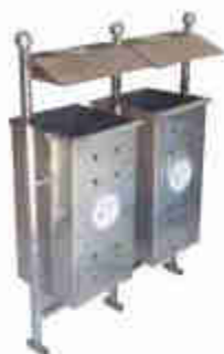
Code : QEE HD-80L