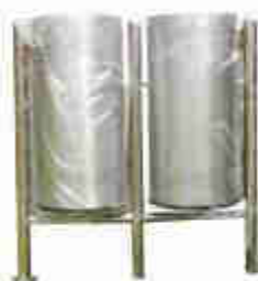
Code : QEE SB-10L