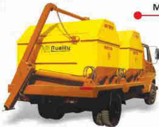
Model : QEETBDP - 6 M 3