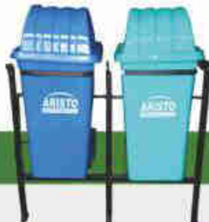
CODE : QEE DH BIN (Capacity 40-300 Ltr.)