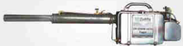
QEEFOG - 2000NK