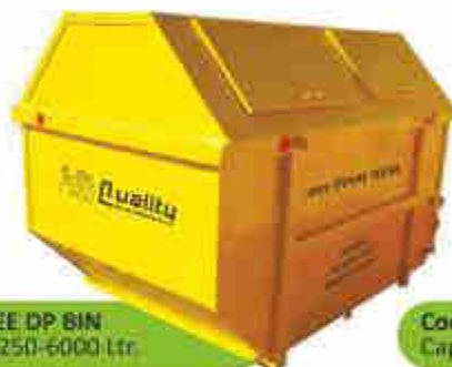
Code : QEE DP BIN Capacity 250-6000 Ltr.