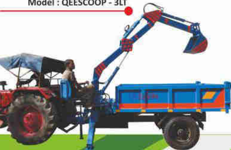
Model : QEESCOOP - 3LT