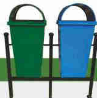
CODE : QEE DH BIN (Capacity 40-300 Ltr.)