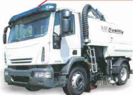
Model : QEESWEEP - 6.5M 3