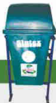
CODE : QEE DH BIN (Capacity 40-300 Ltr.)