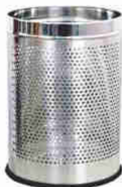
Code : QEE SS-40L