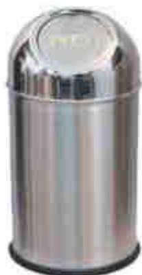
Code : QEE 40L