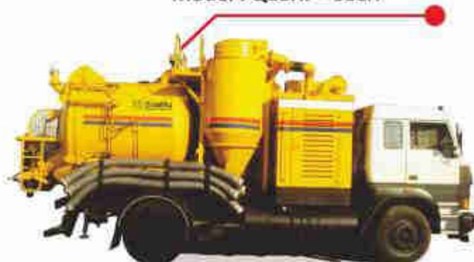
Model : QEEHF - 6LCH