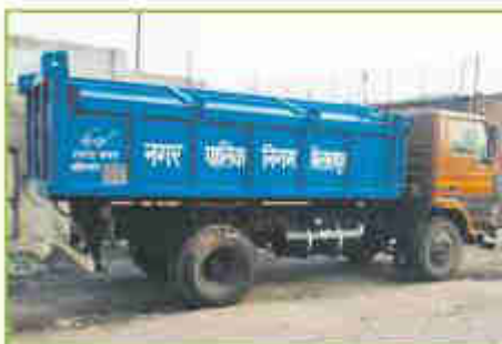
QEECTP - 4 M 3