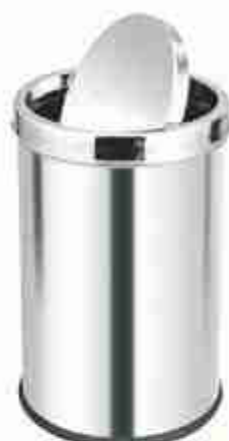
Code : QEE SS-40LS