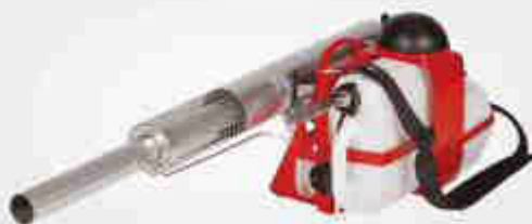
K - 10 SP