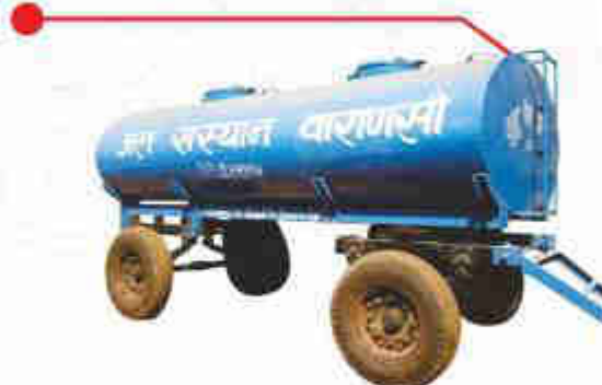
Model : QEEWT - 4LT