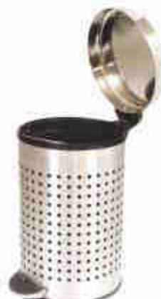
Code : QEE SS-20LP