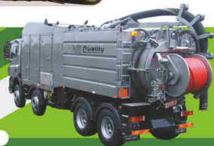
Model : QEERSSJM - 10LCH