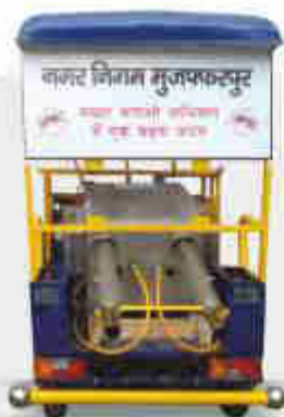
E-RICKSHAW INSTALLATION FOGGING MACHINE