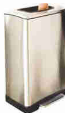
Code : SS BIN