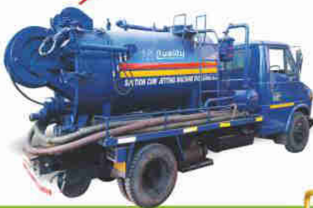
Model : QEESJM - 4LCH