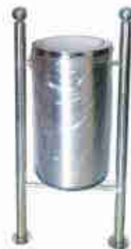
Code : QEE SB-40L