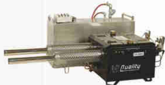
QEEFOG - 4000NK