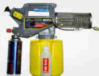
QEEFOG - 2000NK-M