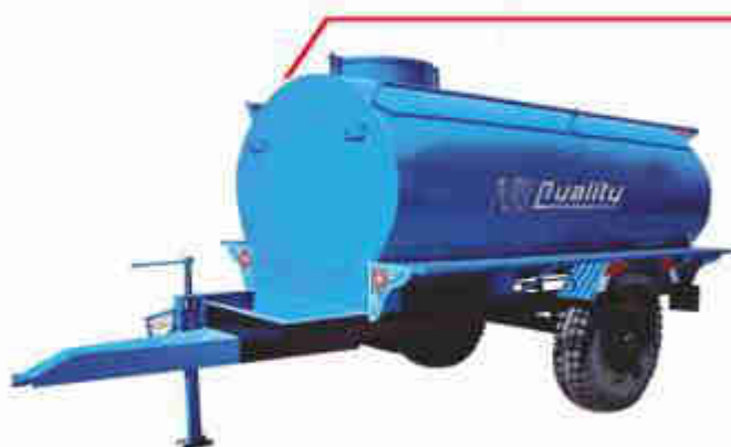
Model : QEEWT - 3LT