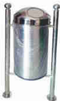
Code : QEE SB-60L