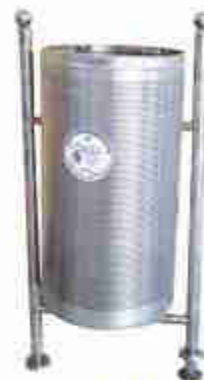
Code : QEE SB-100L