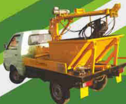
Manhole Desilting Machine