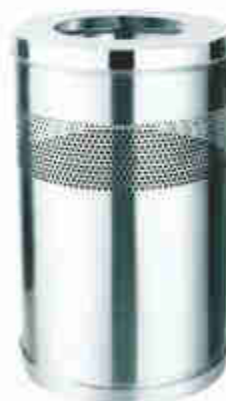
Code : QEE SS-20L