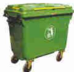
CODE : QEELLOPE (Capacity: 65-11M³)