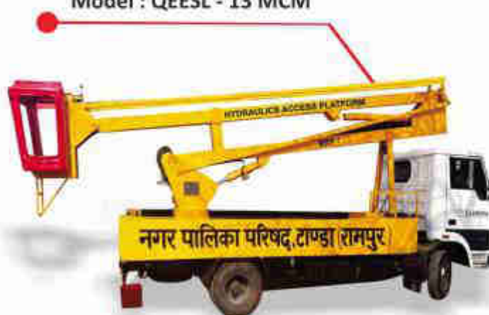
Model : QEESL - 13 MCM