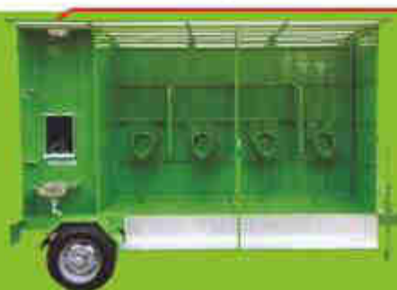
Model : QEEMU - 4ST