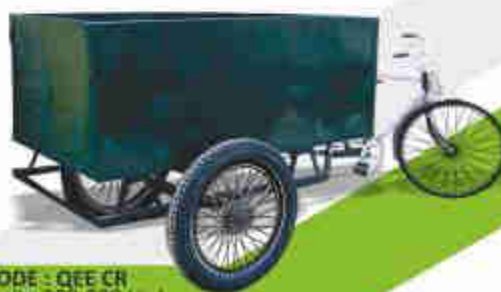
CODE : QEE CR (Capacity 200-800 Ltr.)