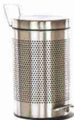
Code : QEE SS-10LP