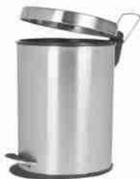
Code : QEE SS-20LP