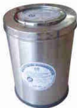
Code : QEE SS-10L