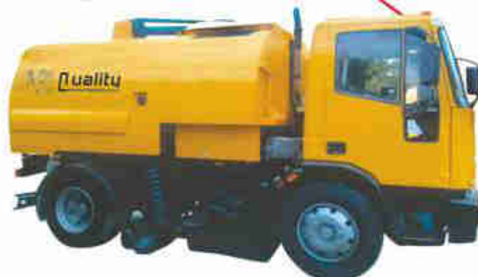
Model : QEESWEEP - 4M 3