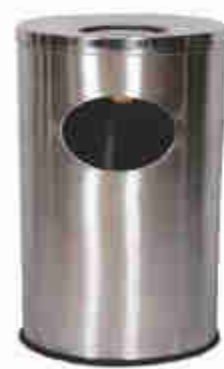
Code : QEE SS-20LP