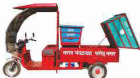
CODE : QEE TP (Capacity 350-800 Ltr.)