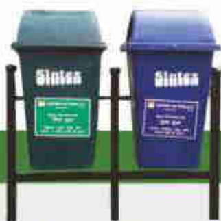
CODE : QEE DH BIN (Capacity 40-300 Ltr.)