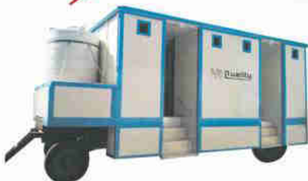
Model : QEEMT - 4STPPGI