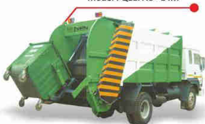
Model : QEEPAC - 14M 3