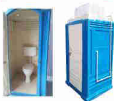
Model : QEEPTSS - 1STD