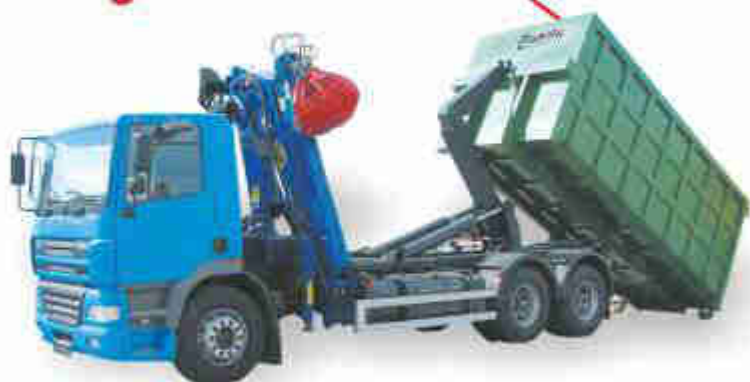
Model : QEEHL - 14M 3