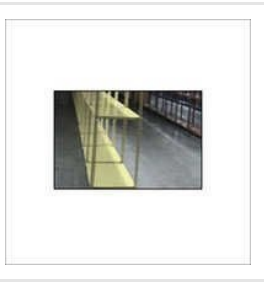
Slotted Angle Racks