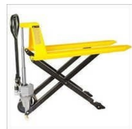
SCISSOR HAND PALLET TRUCK