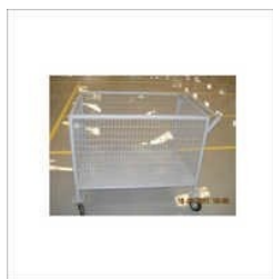
MATERIAL HANDLING TROLLEY