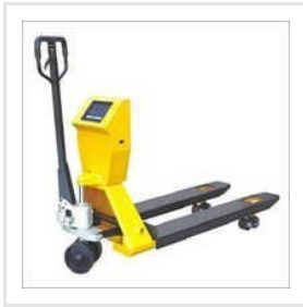
Weighing Scale Hand Pallet Truck