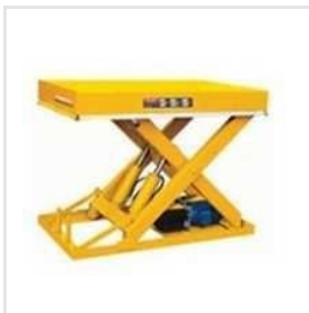
Scissor Lift Table