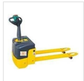
Battery Operated Pallet Truck