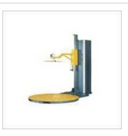
Pallet Wrapping Machine