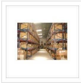
Heavy Duty Racks