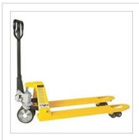
Hand Pallet Trucks