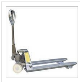
Stainless Steel Pallet Truck