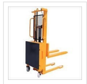
Semi Electric Stacker