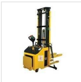
Battery Operated Stacker