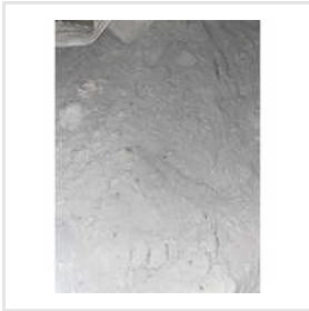
White Pulver Powder