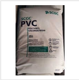
SCG SP660 Polyvinyl Chloride Resin