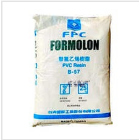
B-57 PVC Resin