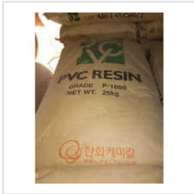
P-1000 Grade PVC Resin