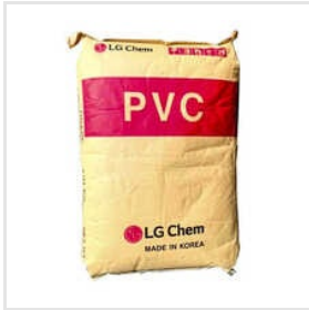
LG CHEM LS100H PVC Resin