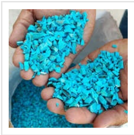
Plastic Blue Regrind