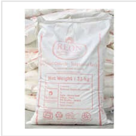
K6701 PVC Resin