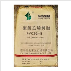
SG-5 PVC Resin