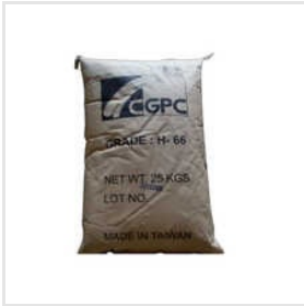
H 66 CGPC PVC Resin