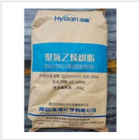
HS-1000R Type Polyvinyl Chloride