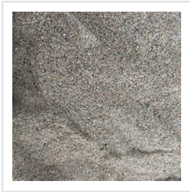
Grey Pulver Powder