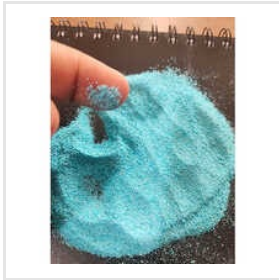
Blue Pulver Powder