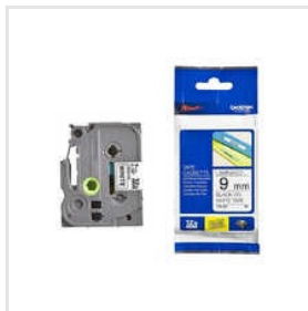
Ink Ribbon And Tape