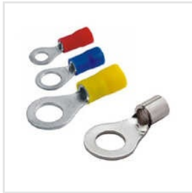
Insulated Ring Socket