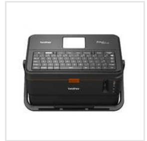
PT E850TKW Ferrule Printing Machine