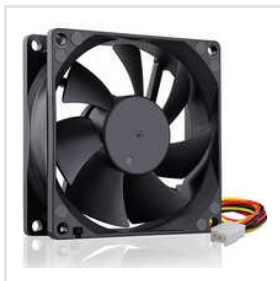
12V Cooling Fan