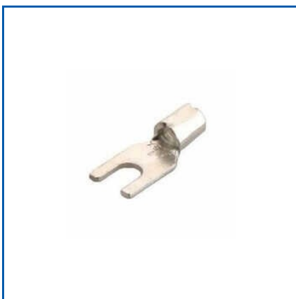
HEX FORK TYPE LUG

1 Phase Surge Protective Device, 1 Pole Miniature Circuit Breaker, 10250t Push Button, 12V Cooling Fan, 2 Meter Solid Copper Earth Rod, 2 Phase Surge Protective Device, 2 Pole Miniature Circuit Breaker, 24 pin Heavy Duty Connector, 3 Phase Surge Protective Device, 3 Pole Miniature Circuit Breaker, 4 Phase Surge Protective Device, 90MM PVC Spiral, ABB Legend Plate, AC Axial Cooling Fan, AC DC Distribution Box, etc.