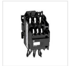
Capacitor Duty Contactor