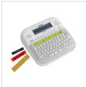
PT-D400 P-Touch Printer