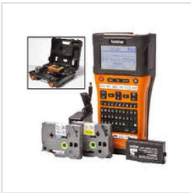
PT-E550WVP P-Touch Printer