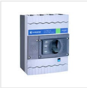
E4N250D Molded Case Circuit Breaker