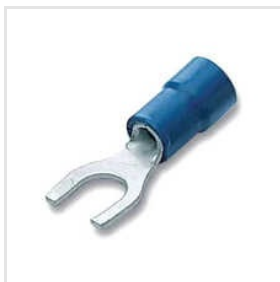
Double Grip Reinforcements-Fork