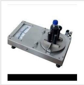
Spring Torque Meter