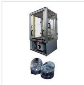
Hot Wire Jar Cutter Machine