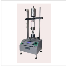
Digital Automatic Torque Tester