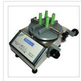
Bottle Cap Torque Tester