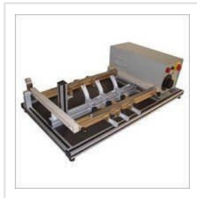
Hot Wire Bottle Cutter Machine