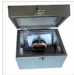
BASE CLEARANCE TESTER