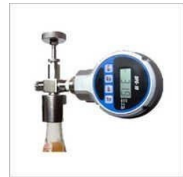
VACUUM STRENGTH TESTER