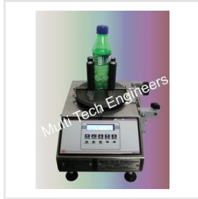
Digital Cap Torque Tester