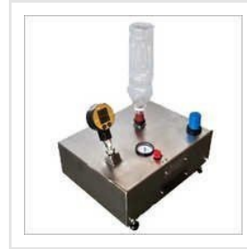
Hot Fill Containers Vacuum Tester