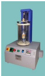
CAP TOP LOAD TESTER

Automatic Torque Tester, Base Clearance Tester, Beverage Degasser, Bottle Cap Torque Tester, Bottle Closure Torque Tester, Bottle Height Gauge, Bottle Seal Tester, Bottle Top Load Tester, Bottle Torque Tester, Cap Sterilizer Conveyor, Cap Top Load Tester, Circumference Tape, Colour Matching Cabinet, Cooling Tunnels, Crown Crimp Gauge, etc.