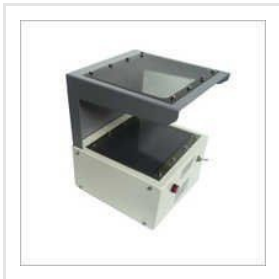
Preform Testing Equipment