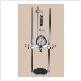
PET Bottle Testing Equipment