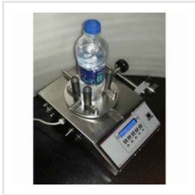
Bottle Torque Tester