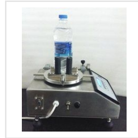
Bottle Closure Torque Tester