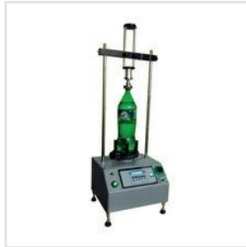
Automatic Torque Tester