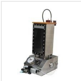
Bottle Seal Tester