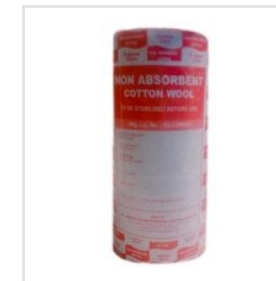
Non Absorbent Cotton Wool