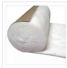
400gm 300gm Gross Weight Cotton Roll