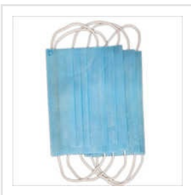
3 Ply Mask