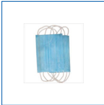
3 PLY MASK