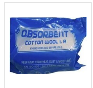
Medical Surgical Cotton