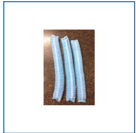
SURGICAL DISPOSABLE CAP