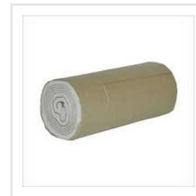
Gross Cotton Roll