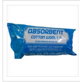
Absorbent Cotton Wool