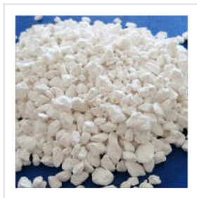
Calcium Chloride Lumps