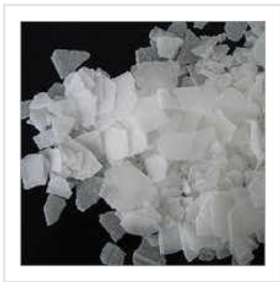
Magnesium Chloride Hexa Hydrate