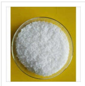
Zinc Sulphate Heptahydrate Purified