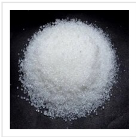
Ammonium Sulphate Crystal