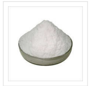
Zinc Sulphate Monohydrate