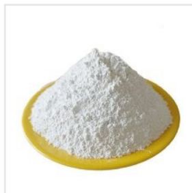
Magnesium Carbonate Light