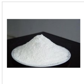
Ammonium Sulphate Powder