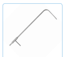
Pitot Tube for Air Velocity (Si-AQ Pitot Tube)