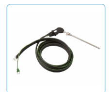
Sampling Probe (Si-AQ Probe with Hose)