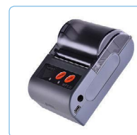
Bluetooth® Printer (Si-AQ Bluetooth® Printer)