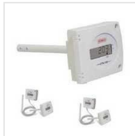
Kimo Air Velocity Transmitter Kimo