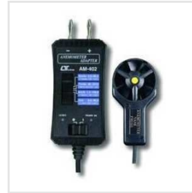
Lutron AM-402 Anemometer Adapter