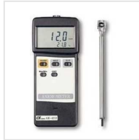
Lutron Mini Vane Anemometer AM