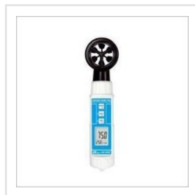
Vane Digital Anemometer