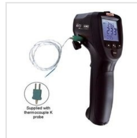
Infrared Digital Thermometer