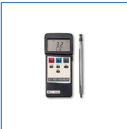
LUTRON MINI VANE ANEMOMETER

Clamp Meter Suppliers, D3 IU Per Minute Solar Meter, Erythemally Effective (Eeff) UV Index Meter, Eutech CON 700, Fluke Clamp Meter , Fluke 362 Clamp Meter , Fluke 381 Remote Display True-rms AC/DC Clamp Meter with iFlex , Fluke CNX a3000 AC Wireless Current Clamp Module , Fluke CNX i3000 iFlex AC Wireless Current Module , HTC Body Scan Infrared Thermometer, HTC Easylog Digital Temperature Mobile Data Logger, HTC Thermo Hygrometers, Lutron Gasline Tachometers , MED/HR Erythemally Effective (Eeff) UVR Index Meter, Ratchet Wrench, etc.