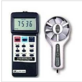
Lutron Metal Vane Air Flow CMM CFM AM-