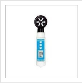
Vane Anemo/ Barometer / Humidity