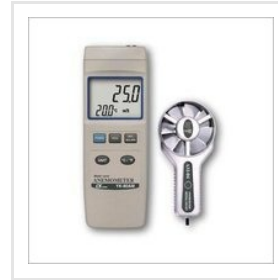
Lutron Digital Metal Vane Anemometer