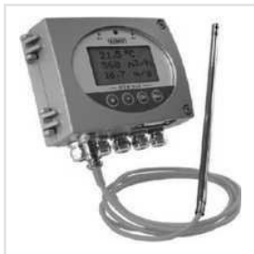
KIMO Air Velocity Air Flow Transmitter