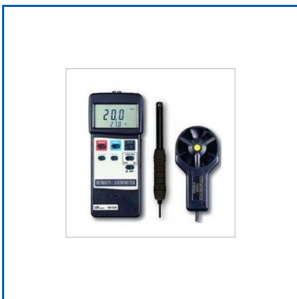
LUTRON ANEMOMETER WITH HUMIDITY METER