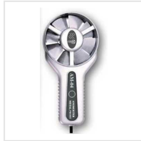
Lutron Spare Fan & Fan Set Vane Type