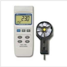
Real Time Data Logger