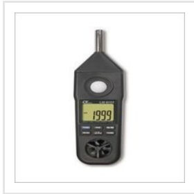
Lutron LM-8102 5 In 1 Anemometer