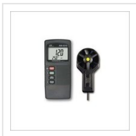
Lutron AM-4210 Anemometer