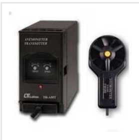
Lutron TR-AMT1A4 Anemometer