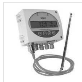
Transmitters Air Velocity