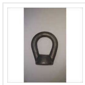
Eye Nut Forgings