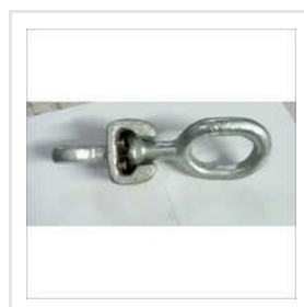
Torsion Assembly Eye Hook