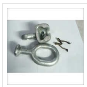
Torsion Assembly Arrangement