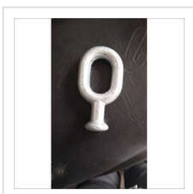
Nut Oval Eye Hot Dip Galvanized