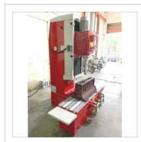
Vertical Fine Boring Machine