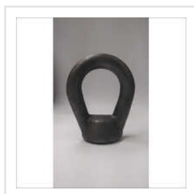
Eye Nut Forging