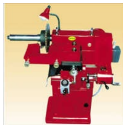
BRAKE DRUM MACHINE