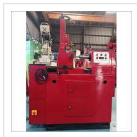
Connecting Rod Boring Machine