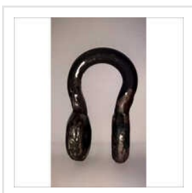
Anchor D Shackle