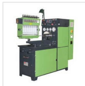
Diesel Fuel Pump Test Machine