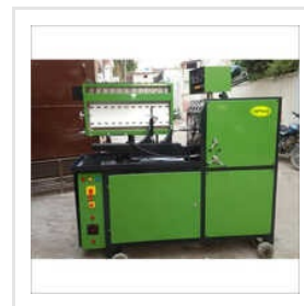
Diesel Fuel Pump Testing Machine