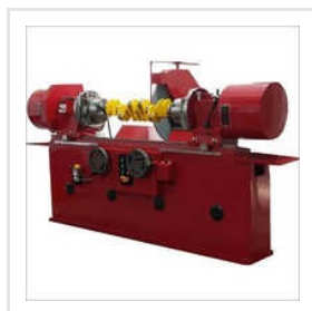
Crankshaft Grinder Machine