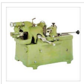
Valve Refacer Machine