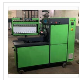
Pump Testing Machine