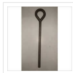
Forged Eye Bolt