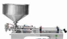
SEMI AUTOMATIC SINGLE HEAD PASTE FILLING MACHINE