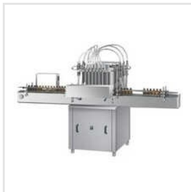
Fully Automatic Liquid Filling Machine