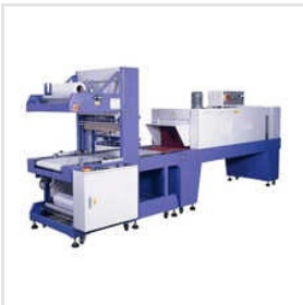
Auto Web Sealing And Shrink Tunnel Machine