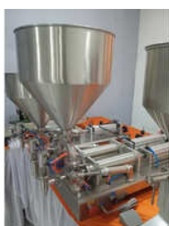
FULLY AUTOMATIC PASTE FILLING MACHINE

Incline conveyor , s s conveyor , Auto L Type Sealer, Auto Sleeve Wrapper Web Sealer, Auto Sleeve Wrapping /web sealer machine , Auto Sleeve Wrapping Machine, Box Compression Tester, Carton Sealing Machine, Chain conveyor , Chamber Type Shrink Wrapping Machine, Conveyor , Corrugated Machine Heating Control Panel, Drive Control Panel, Economy Shrink Tunnel, Electrical Panel, etc.