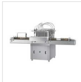
Fully Automatic Volumetric Liquid