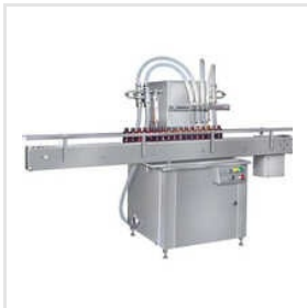
Automatic Bottle Filling Machine