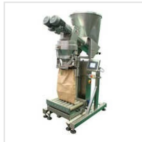
Automatic Bag Filling Machine