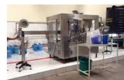
90 BPM WATER BOTTLE FILLING MACHINE