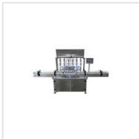
Fully Automatic Paste Filling Machine