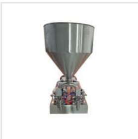
Semi Automatic Paste Filling Machine