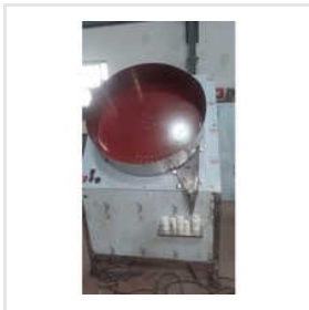
Semi Automatic Tablet Counting And Filling