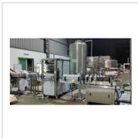
Primary Liquid Filling Line Automation