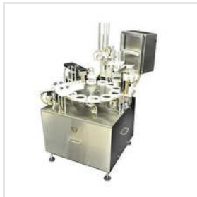
Stainless Steel Cup Filling Machine