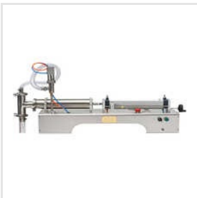
Semi Automatic Liquid Filling Machine