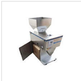
Semi Automatic Powder Filling Machine