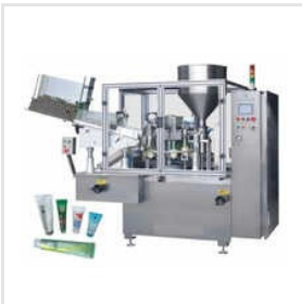
Automatic Pest Ointment Filling